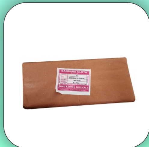
Rolled Cloth Bandages