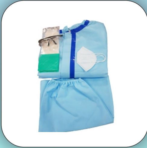
90 Gsm Laminated Cover Suit