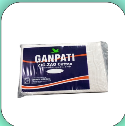
Zig Zag Cotton