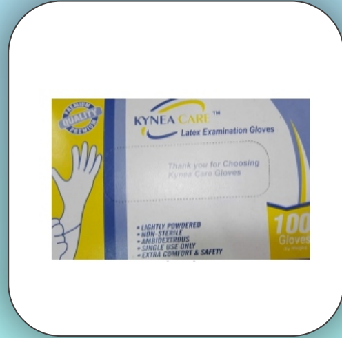
Latex Examination Gloves