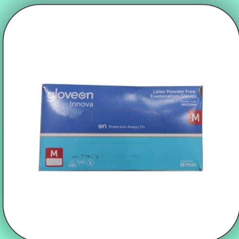
Latex Powder Free Examination Gloves