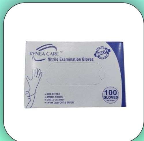
Nitrile Examination Gloves