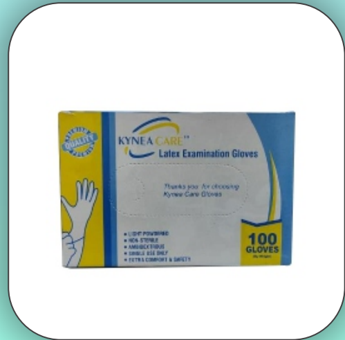
Latex Examination Gloves