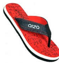
Mens Red Cotton Strap Slipper