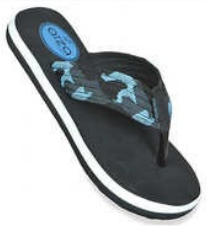
Black Blue Cotton Strap Slipper