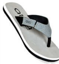
Grey Cotton Strap Slipper