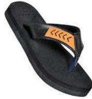
Mens Black Cotton Strap Slipper