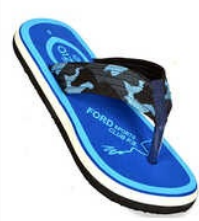
Blue And Purple Cotton Strap Slipper