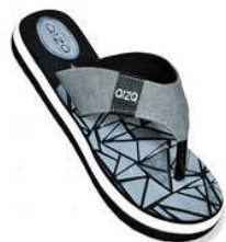
Black Cotton Strap Slipper