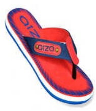
Red Cotton Strap Slipper