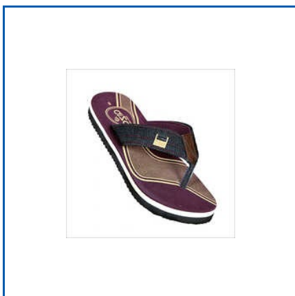
SOFT COTTON STRAP SLIPPER

Black And Beige Cotton Strap Slipper, Black Cotton Strap Slipper, Black blue Cotton Strap Slipper, Blue And Black Cotton Strap Slipper, Blue And Purple Cotton Strap Slipper, Blue Cotton Strap Slipper, Brown or Choco Cotton Strap Slipper, Green Cotton Strap Slipper, Grey Cotton Strap Slipper, Grey Cotton Strap Slipper, Mens 1.88 mm Slipper, Mens Black Cotton Strap Slipper, Mens Blue Black Cotton Strap Slipper, Mens Brown Cotton Strap Slipper, Mens Cotton Strap Slipper, etc.