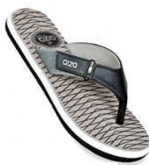
Grey Cotton Strap Slipper