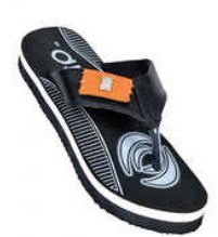
Black And Beige Cotton Strap Slipper