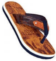
Mens Brown Cotton Strap Slipper