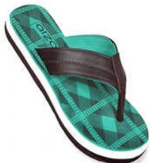
Green Cotton Strap Slipper