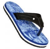
Mens Cotton Strap Slipper