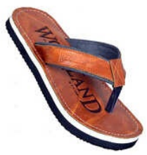
Mens Fancy Slipper