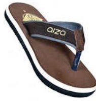
Mens Fancy Cotton Strap Slipper