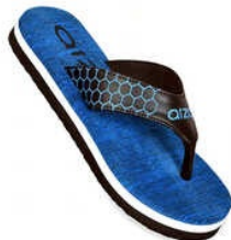
Blue Cotton Strap Slipper