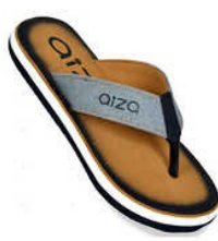
Grey Cotton Strap Slipper