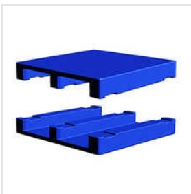
Blue Roto Mould Plastic Pallets