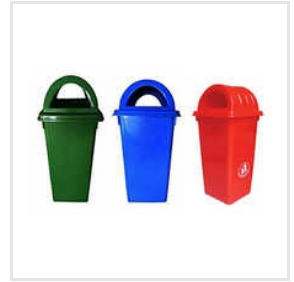
110 Litres Waste Bin