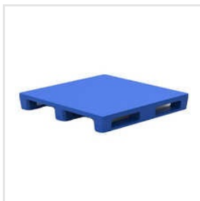
Industrial Roto Mould Plastic Pallets