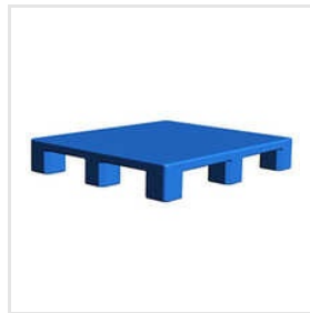
1200 Mm Roto Mould Plastic Pallets