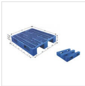
Blue Injection Mould Plastic Pallets