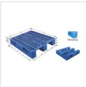
160 Mm Injection Mould Plastic Pallets