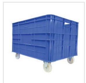
Plastic Crates With Wheels