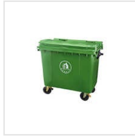
660 Litres Waste Bin