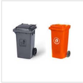
240 Litres Waste Bin