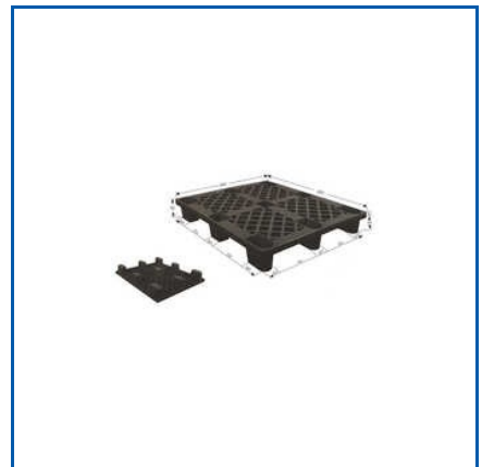
BLACK INJECTION MOULD PLASTIC PALLETS