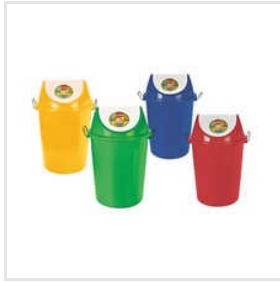
80 Litres Waste Bin