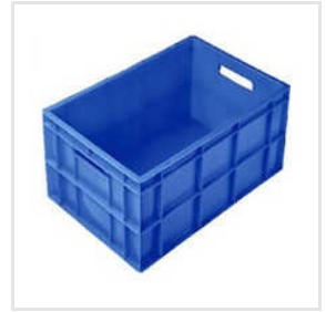
400 Mm Plastic Crates