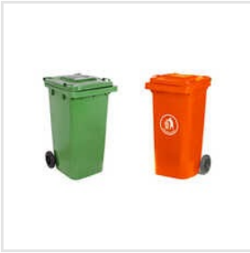
120 Litre Waste Bin