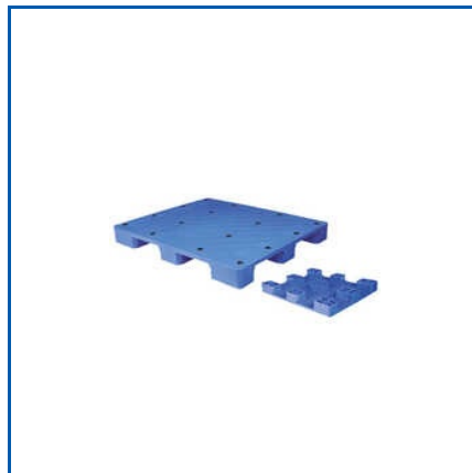
1200 MM INJECTION MOULD PLASTIC PALLETS