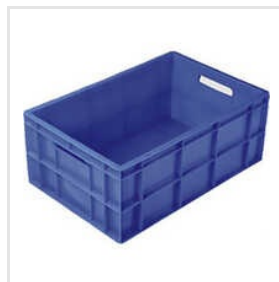
600 Mm Plastic Crates