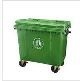
1100 Litres Waste Bin