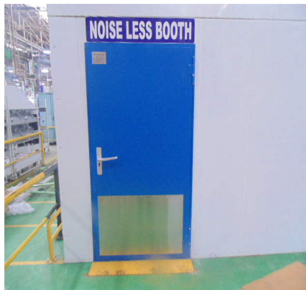
Single leaf Door