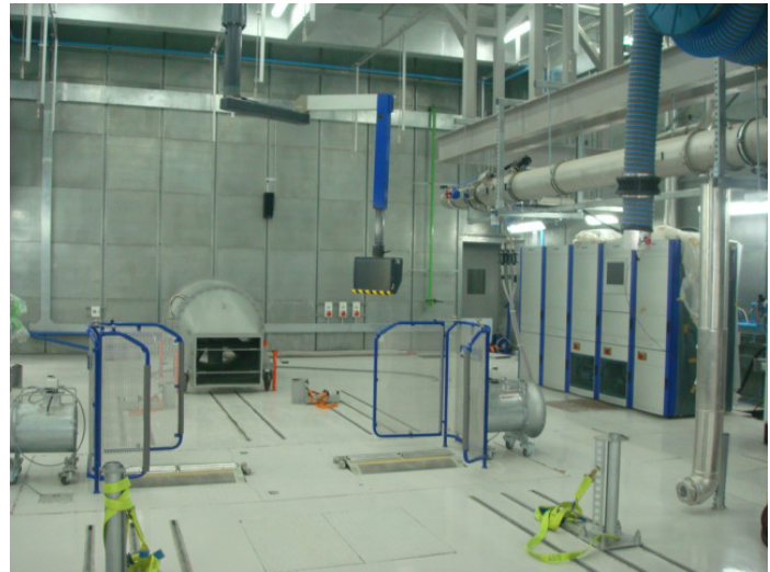
Acoustic Lining with 850x920x50mm Panels.