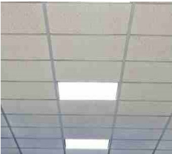
Acoustic False Ceiling