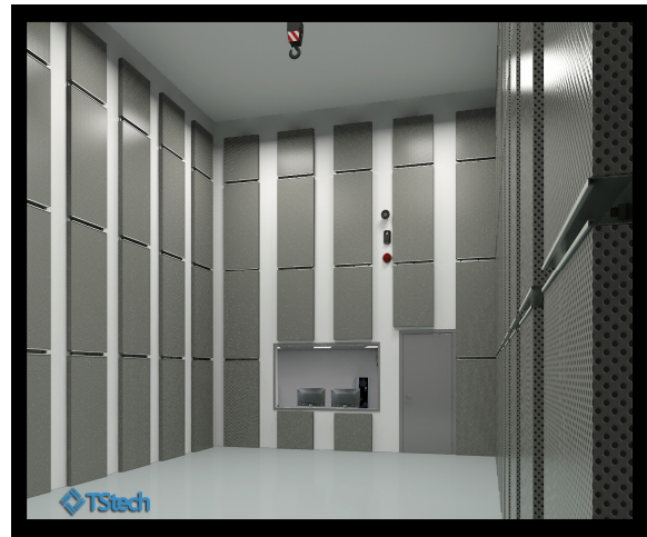
Imported Acoustic lining Installed by PS