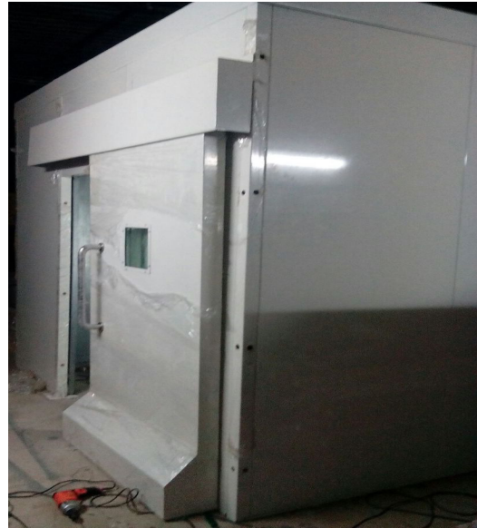
Single leaf Sliding Door