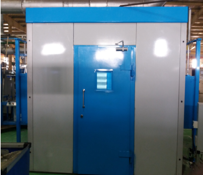
Acoustic Chamber with Automation