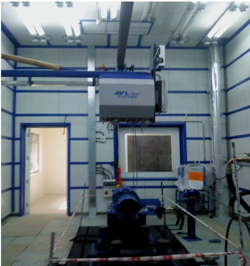
Acoustic lining with 600x600x50mm Panels