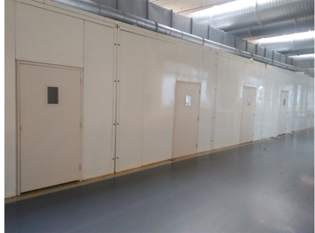
Acoustic Chamber for Two Wheeler Engine Noise Testing