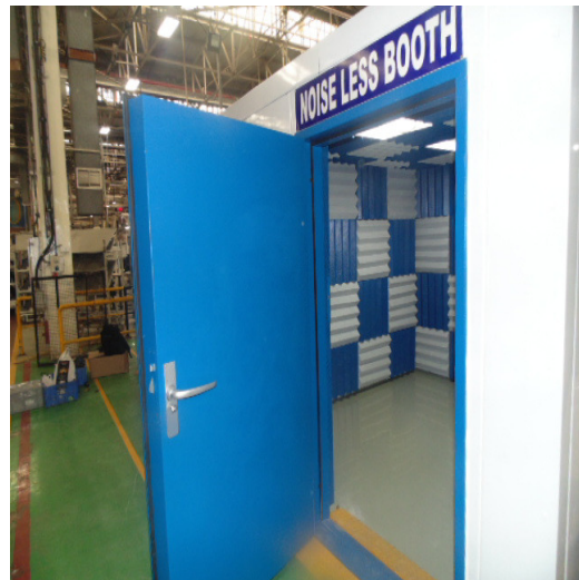
Acoustic Chamber with Mini Wedges