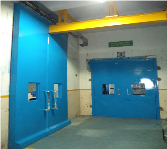
Double Leaf Sliding Door