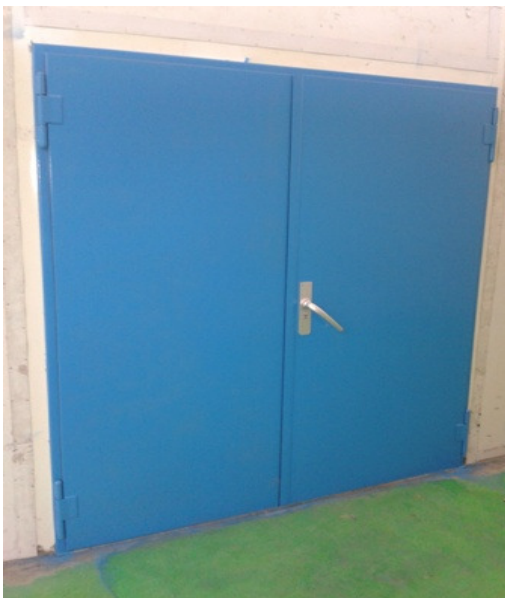
Double Leaf Door