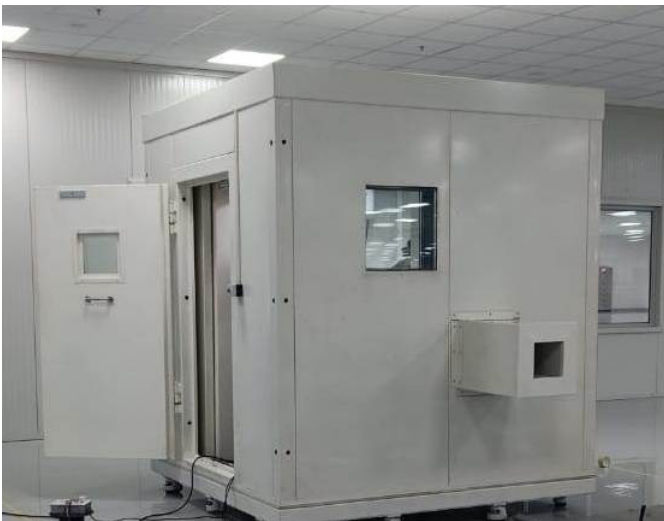
Acoustic Chamber with Silencer & Wheels