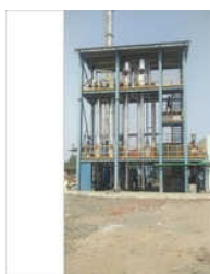
Forced Circulation Evaporator