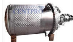
SS Pillow Plate Reactor