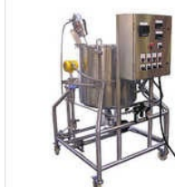
SS Process Reactor