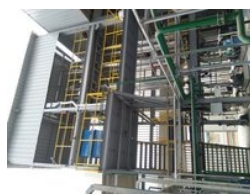
Industrial Multi Effect Evaporator