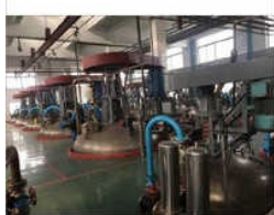
Guar Gum Plant