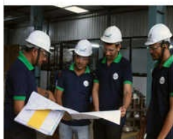
Consultancy And Services