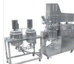
SS Chemical Reactor