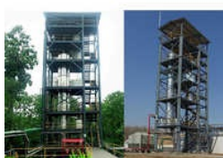
Multi Solvent Recovery Plant