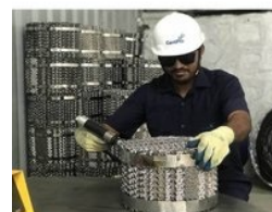
Random And Structure Packing