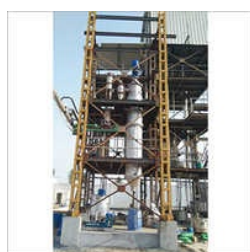
Industrial Agitated Thin Film Dryer