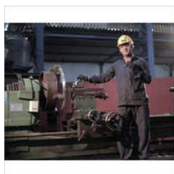
PROCESS ENGINEERING SERVICE

Caustic Recovery Plant, Caustic Soda Recovery Plant, Chemical Storage Tank, Consultancy And Services, Design Engineering Service, Distillation Column, Edible Oil Refinery Plant, Evaporator Plant, Falling Film Evaporator Plant, Forced Circulation Evaporator, Guar Gum Plant, Herbal Extraction Plant, Industrial Agitated Thin Film Dryer, Industrial Agitator, Industrial Distillation Columns, etc.