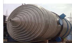
Steel Storage Tanks