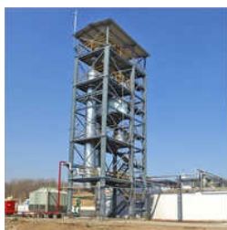
Industrial Distillation Columns