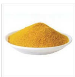
Poly Aluminium Chloride