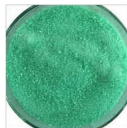
Ferrous Sulphate Heptahydrate