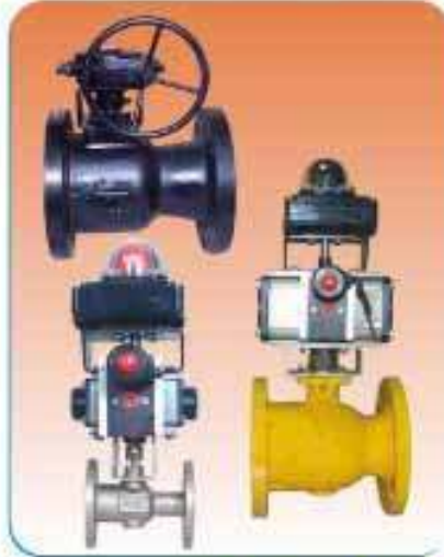
BALL VALVE FIRE SAFE ONE PC PNEUMATIC AND GEAR OPERATOR