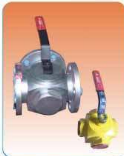
BALL VALVE THREE WAY L-T PORT FLANGED & SCREWED