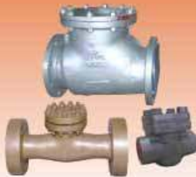
CHECK VALVE CAST STEEL, FORGED STEEL FLANGED & SOCKET WELD