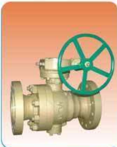
BALL VALVE FIRE SAFE TWO PC TRUNNION MOUNTED FLANGED