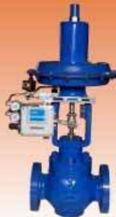
GLOBE PNEUMATIC CONTROL VALVE CAST STEEL ON/OFF FLANGED END