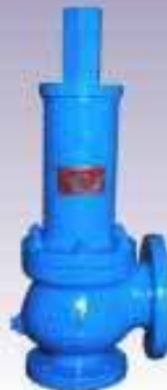
SAFETY RELIEF VALVE FLANGED END