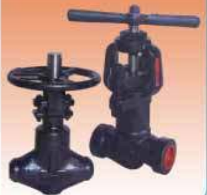
GLOBE AND GATE HIGH PRESSURE VALVE SOCKET & BUT WELD END