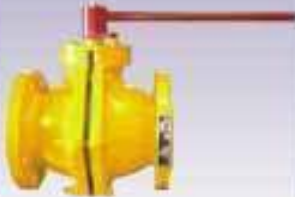
BALL VALVE TEFLON LINE