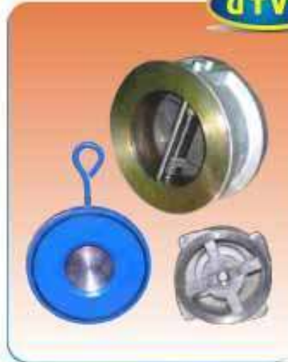
CHECK VALVE WAFER, DISC, DUAL PLATE TYPE