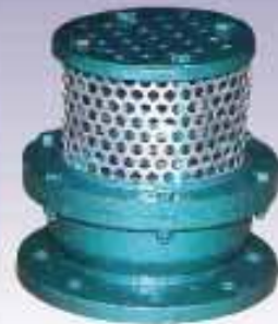
FOOT VALVE FLANGED END