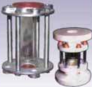
FULL VIEW SIGHT GLASS FLANGED END