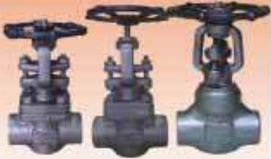
GATE GLOBE VALVE FORGED STEEL SOCKET WELD, 3W, CLASS 800