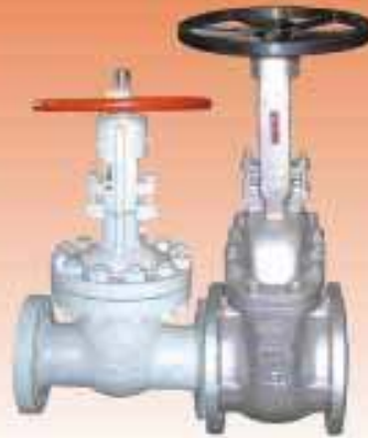
GATE VALVE CAST STEEL FLANGED END