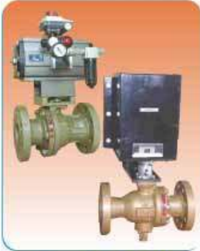
BALL VALVE FIRE SAFE TWO PC PNEUMATIC AND ELECTRICAL TYPE