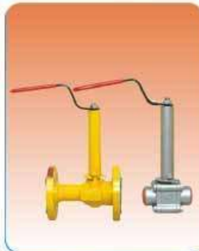
BALL VALVE THREE & ONE PC CRYOGENIC EXTENSION SPINDLE