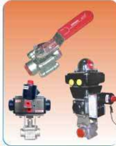
BALL VALVE THREE PC 800 SE PNEUMATIC AND LEVER OPERATOR