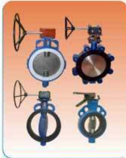
BUTTERFLY VALVE MANUAL AND GEAR OPERATOR