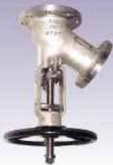
FLUSH BOTTOM VALVE FLANGED END