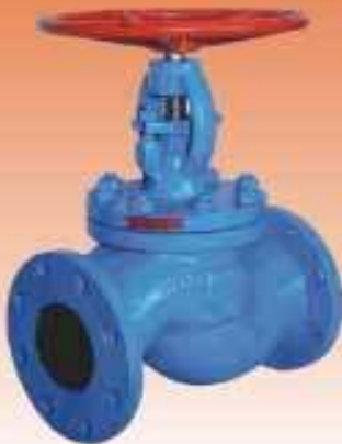
GLOBE VALVE CAST STEEL STEAM ND TYPE FLANGED END