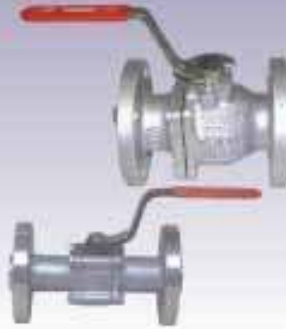
BALL VALVE TWO THREE PC FLANGED END