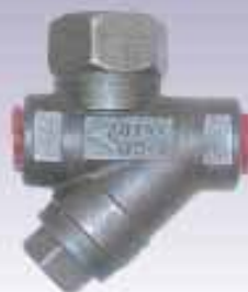
THERMODYNAMIC STEAM TRAP-TD3 BSPT