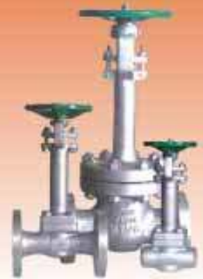
GATE VALVE CRYOGENIC EXTENSION SPINDLE TYPE FLANGED END