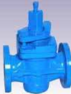
PLUG VALVE FLANGED END