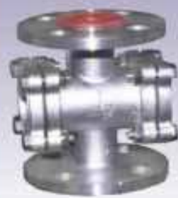
DOUBLE WINDOW SIGHT GLASS FLANGED END