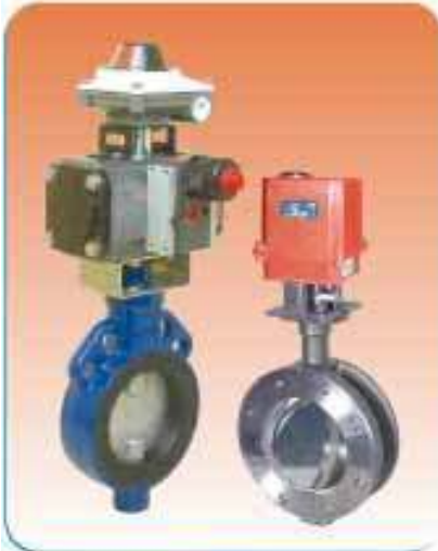
BUTTERFLY VALVE PNEUMATIC AND ELECTRICAL TYPE