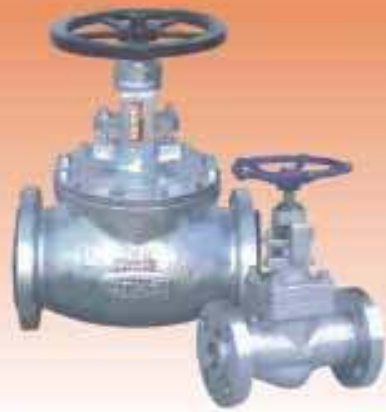
GLOBE VALVE CAST STEEL FLANGED END