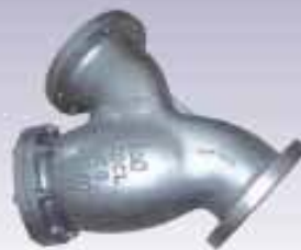
STRAINER Y TYPE FLANGED END