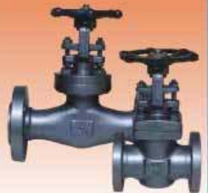
GATE VALVE FORGED STEEL FLANGED END