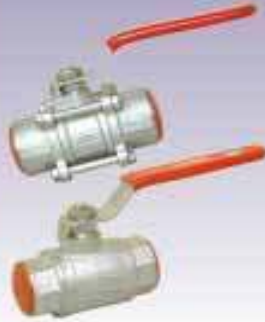
BALL VALVE ONE PC 1000 PSI WOG SCREWED