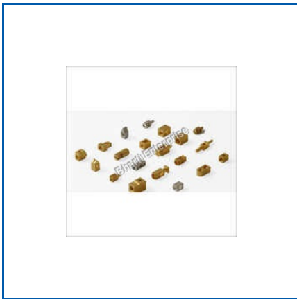
BRASS TERMINALS AND CONNECTORS

Aluminium Components, Aluminium Hex Nuts, Aluminum Bush, Brass Battery Terminals, Brass Bush and nuts for Switches m8 Brass Bush m8 Brass Nuts m8 Brass knurling ring, Brass CNC Turned Parts / CNC Machined Components / CNC Turning Services / CNC Machining Services, etc.