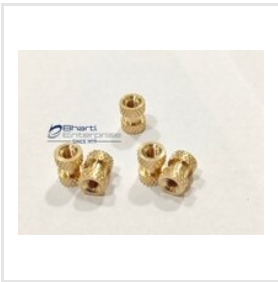
M4 Brass Inserts / M5 Brass Insert / M3 Brass