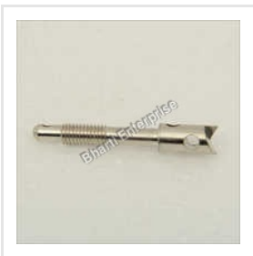
Brass Machined Screws / Brass Sealing