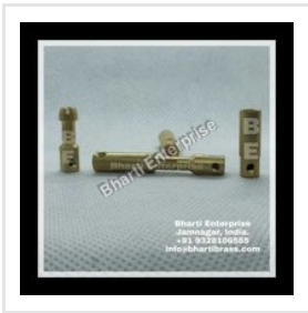
Brass Trailer Plug Pins