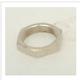
Brass Lock Nut