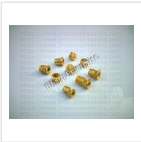
Brass Helical Knurling Inserts