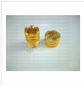
Brass CPVC Inserts