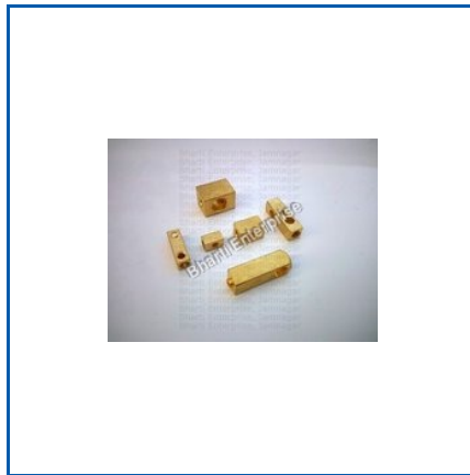
BRASS CONNECTORS/ BRASS TERMINALS