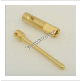
Brass Pin And Sockets