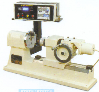
ETSTU / ETSTCU