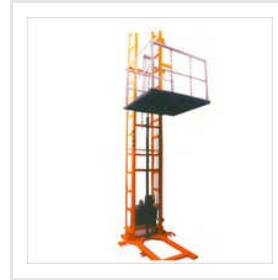
MS Goods Handling Lift