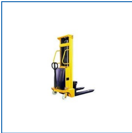
SEMI ELECTRIC HYDRAULIC STACKER