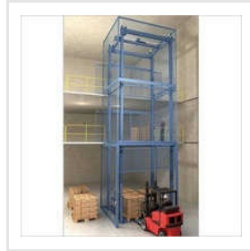
Hydraulic Goods Lift