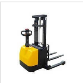
Fully Electric Stacker Wide Type