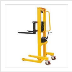
Industrial SS Manual Winch Stacker