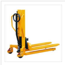
Mini Manual Stackers