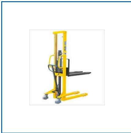
INDUSTRIAL HAND PALLET STACKERS