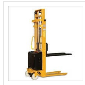
Semi Electric Hydraulic Stackers