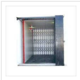
Industrial Hydraulic Goods Lift