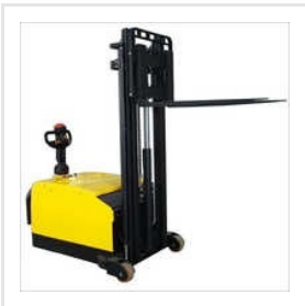
Industrial Counter Balance Stackers