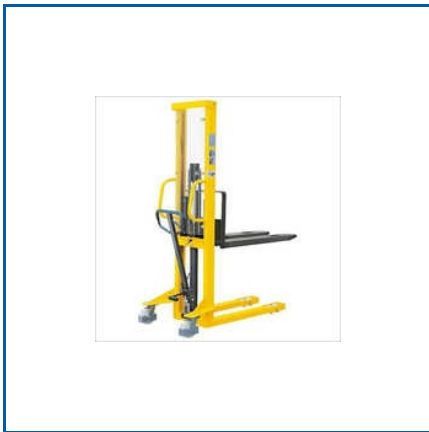
INDUSTRIAL HAND PALLET STACKER

Battery Operated Forklift Maintenance Services, Battery Operated Scissor Lift, Cabin Type Goods Lift, Commercial Goods Lift, Edge of Dock Leveler, Electric Goods Lift, Elevator Operating Panel, Forklift Repairing Services, Fully Electric Stacker, etc.