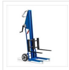
Industrial Manual Winch Stacker