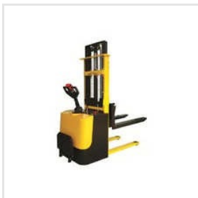
Fully Electric Stacker