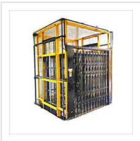
Commercial Goods Lift