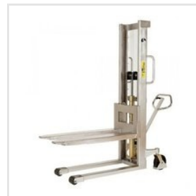
Hydraulic SS Manual Stacker