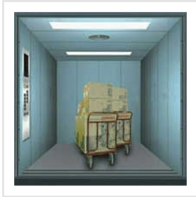
Electric Goods Lift