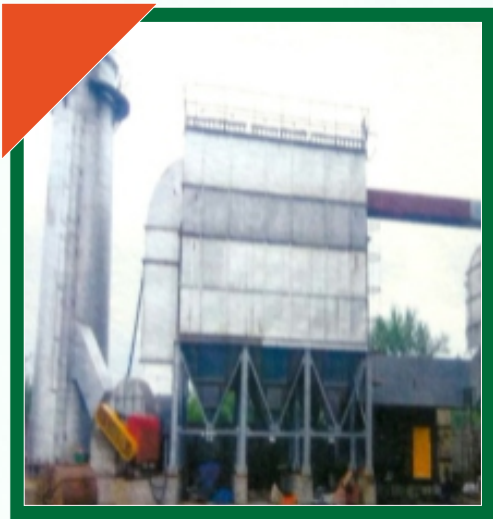
Centralized Dust Extraction System