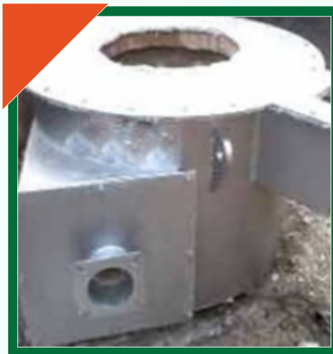
Aluminium Melting Furnace