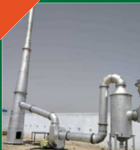
Air Pollution Control System