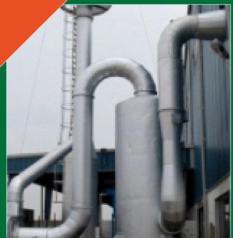
Gas Scrubber System