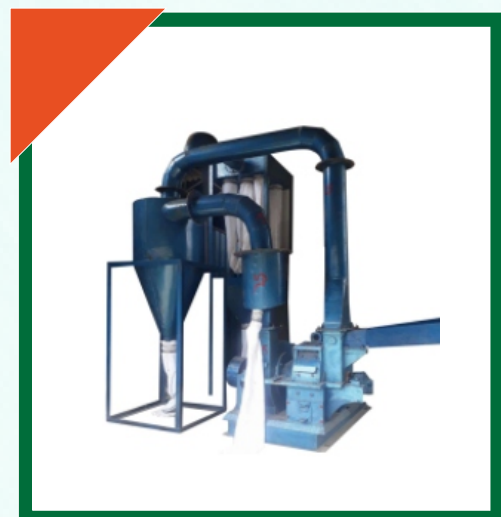
Aluminium Dross Processing Plant