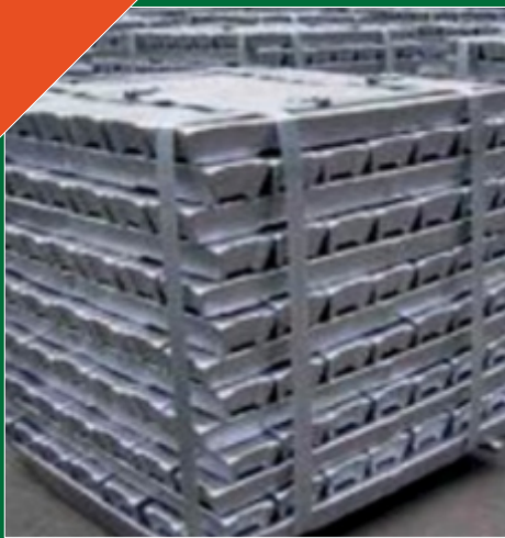
Aluminium Alloy Ingot Manufacturing Plant