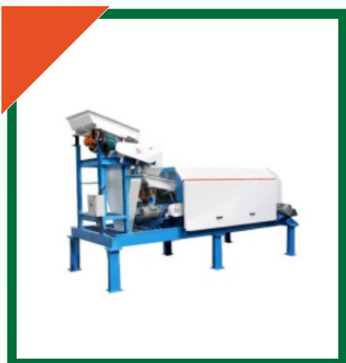
Eddy Current Separator