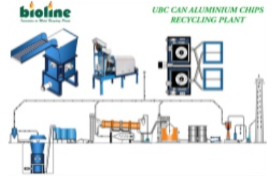
UBC Can Recycling Plant