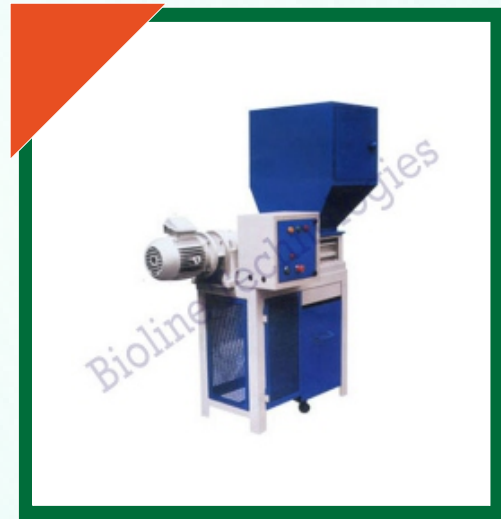
Metal Shredder Machine