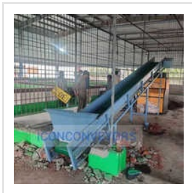
Inclined PVC Belt Conveyor