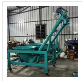
Material Handling Conveyors