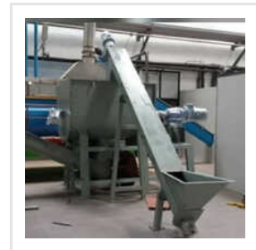
Cement Screw Conveyor