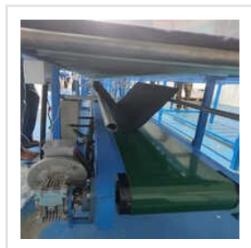
Inspection And Counting Conveyor