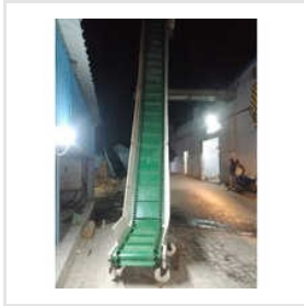
Z Type Cleated Belt Conveyor