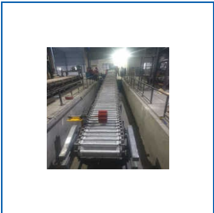
INGOT CASTING CONVEYOR