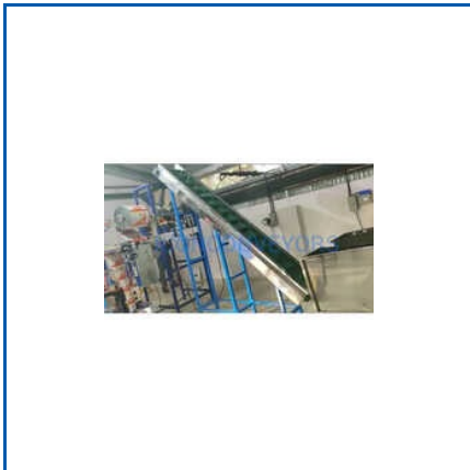
INCLINED CLEATED BELT CONVEYOR

Automated Conveyor System, Automatic Vertical Conveyor, Band Sealing Machine, Conveyor Machine, Flat Conveyor Machine, Gravity Roller Conveyor, Incline Conveyor System, Inclined Belt Conveyor, Material Handling Roller Conveyor, Modular Belt Conveyor, Modular Conveyor System, Packing Belt Conveyor, Portable Belt Conveyors, Roller Aluminum Conveyor, Sealing Machine, etc.