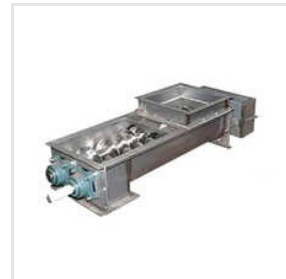
Multi Screw Conveyor