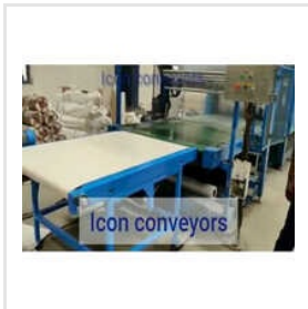
Packing Belt Conveyor