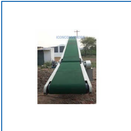
TRUCK LOADING CONVEYORS