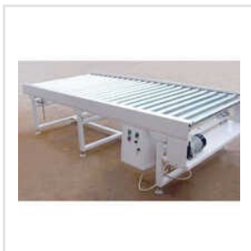
Motorized Roller Conveyor