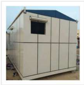
Acp Portable Cabins