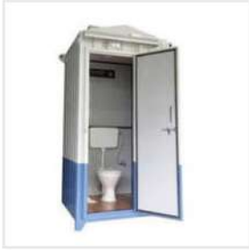
FRP Sintex Portable Toilets