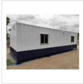
PVC FRP PUF Sandwich Panel Cabin