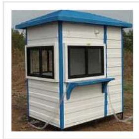
FRP Portable Shelters Cabin