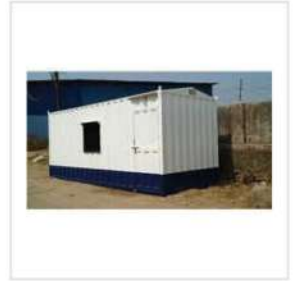
FRP Solar Inverter Room Cabin