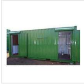
FRP Bunk House Portable Toilets