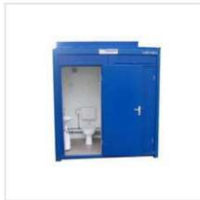
FRP Portable Toilet