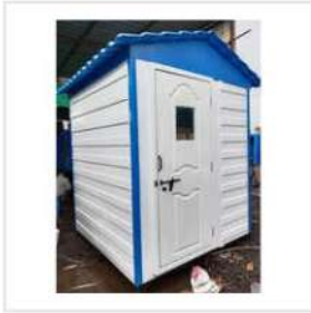
FRP Prefabricated Cabin