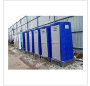
Frp Mobile Toilets