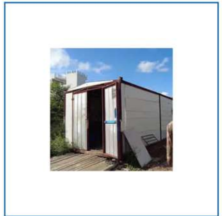
PUF PORTABLE CABIN