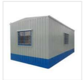
Eco Friendly Custom Built Portable Cabin