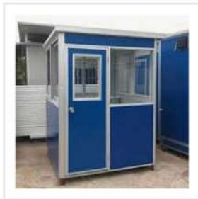
Puf Panel Portable Cabin