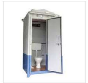
Ready Made Toilet