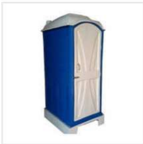
FRP Biodigester Toilet