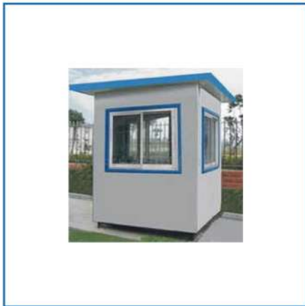
FRP PORTABLE PUF CABIN