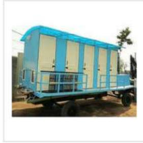
FRP Modular Mobile Toilet Van