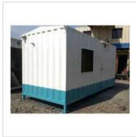
PUF Insulated Cabin