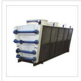
Industrial Cooling Tower