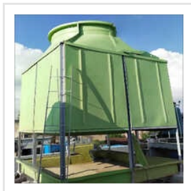
FRP Cooling Tower