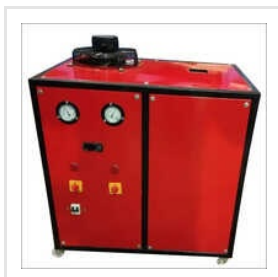
Air Cooling Chiller