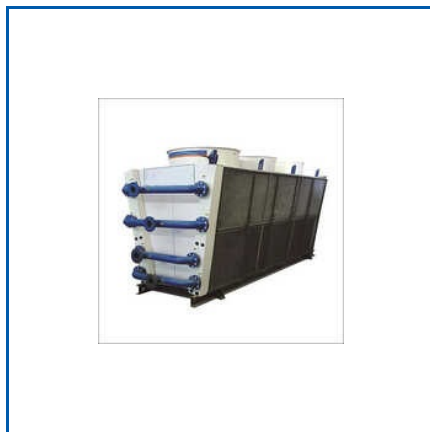
INDUSTRIAL COOLING TOWER