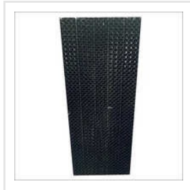
Honeycomb PVC Fill