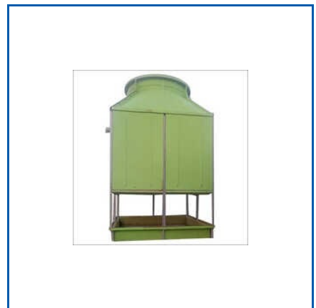
INDUSTRIAL FRP COOLING TOWER