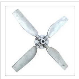
Cooling Tower Aluminium Fan