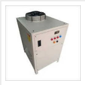
440V Three Phase Industrial Air Chiller