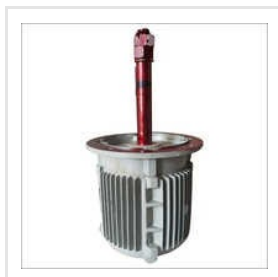
Mild Steel Cooling Tower Motor