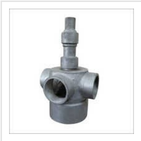
Aluminium Cooling Tower Sprinkler