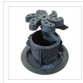
Cooling Tower Spring PVC Nozzle