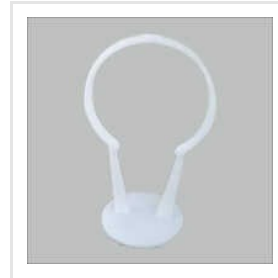
Cooling Tower PVC Nozzle