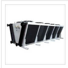
Industrial Mild Steel Cooling Tower