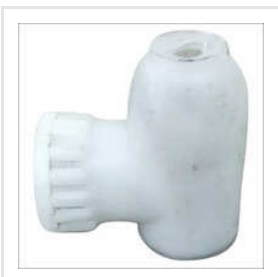
Cooling Tower Sprinkler PVC Nozzle