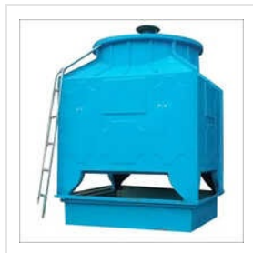
Mini FRP Cooling Tower