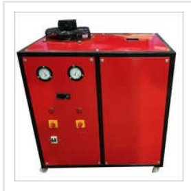
Mild Steel Three Phase Air Chiller