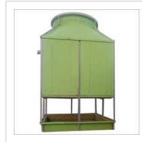
Industrial FRP Cooling Tower