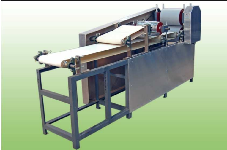
(1).Semi Auto Papad Machine Deluxe.,