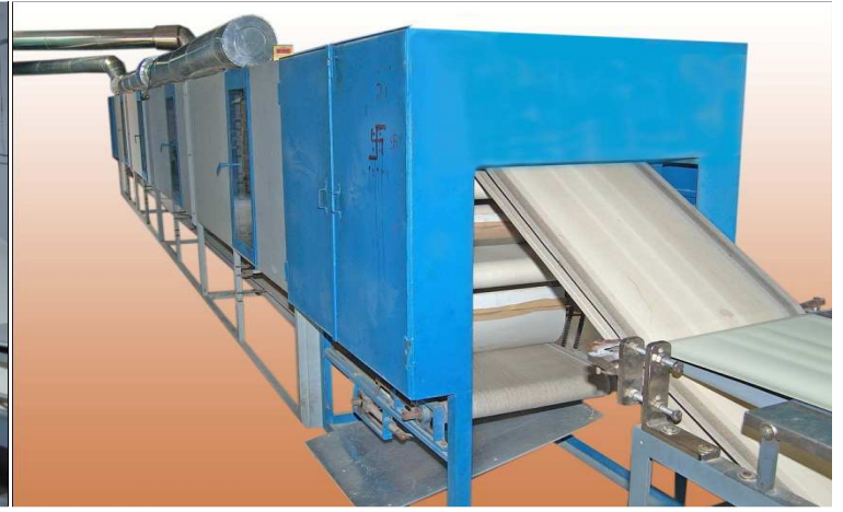
(1).Drier Machine Electrical.