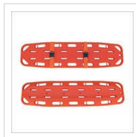
Short Spine Board