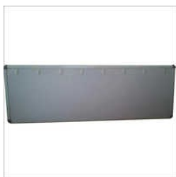
LED X RAY FILM VIEWER

4 Fold Spine Board, ABS Hospital Bed Rail, ABS Plastic Hospital Bed Headboard, Air Splint, Ambulance Auto Loader Emergency Stretcher, Ambulance Bar Light, Auto Loading Ambulance Stretcher, CPR Board, Commode Wheelchair, Digital Display Multipara Monitor, Emergency Transport Ventilator Machine, Evacuation Chairs, Five Function Electric ICU Bed, Foldable Evacuation Chair, Head Immobilizer, etc.