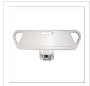
ABS Hospital Bed Rail