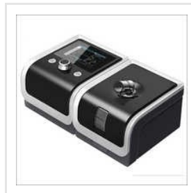
Hospital BIPAP Machine