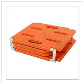
4 Fold Spine Board