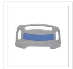
ABS Plastic Hospital Bed Headboard