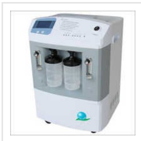
Longfian Jay 10 Oxygen Concentrator