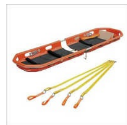
RESCUE BASKET STRETCHER