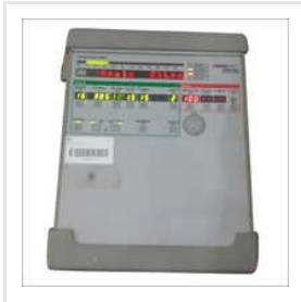
Emergency Transport Ventilator Machine