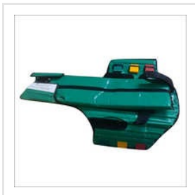
Kendrick Extrication Device