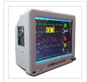
Digital Display Multipara Monitor