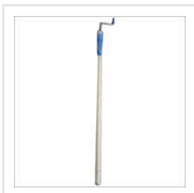
Hospital Crank Handle