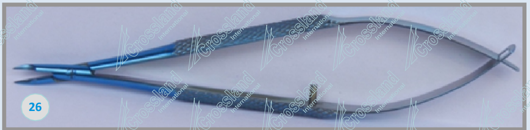
BARRAQUER NEEDLE HODER : (Micro jaw). OVERALL LENGTH 100 mm. FINE 8 mm JAW. POLISHED FINISHED. ROUND KNURLED BODY. (CL-NHT- 024).