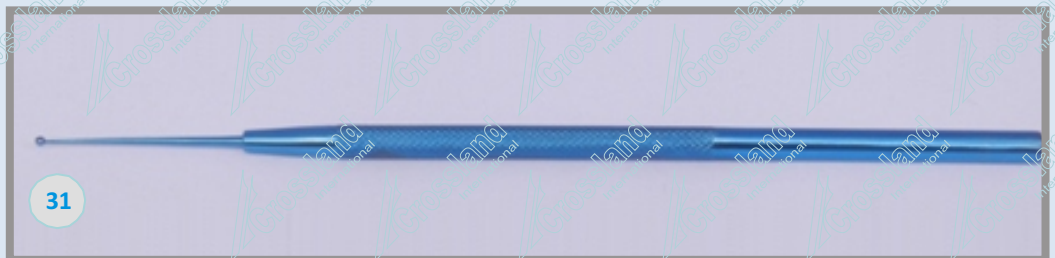
NIGHTINGALE CAPSULE POLISHER. CAPSULE POLISHER RING WITH 1.75 mm DIA. (CL-MNT-029).