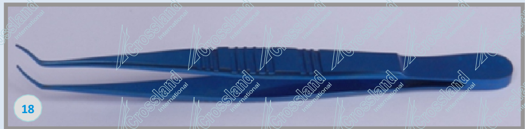
LENS HOLDING FORCEPS. FOR HOLDING & INSERTING FOLDABLE IOL. OVERALL LENGTH 100 mm. SOLID BODY. (CL-TF - 008).