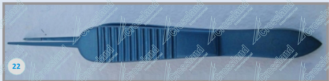
BONN IRIS FORCEPS. SPECIALLY DESIGNED FLAT THREE HOLE BODY. 1 x 2, 0.12 mm. TEETH. (CL-TF- 031).