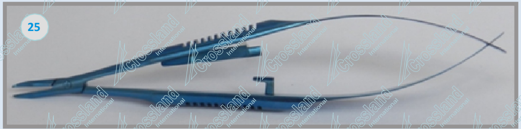
BARRAQUER NEEDLE HODER : (Micro jaw with lock). OVERALL LENGTH 117 mm. FINE 11 mm JAW. POLISHED FINISHED. ROUND SERRATED BODY. (CL-NHT- 023).