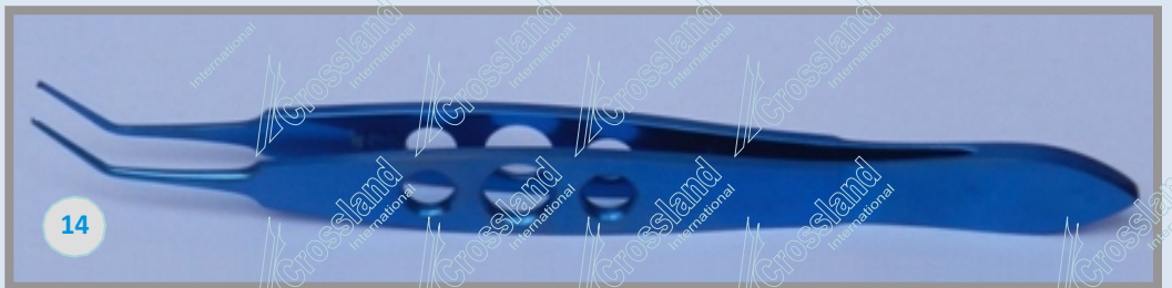
CASTROVIEJO CORNEAL SUTURE FORCEPS. 1 x 2, .05 mm TEETH. FLAT THREE HOLE LONG BODY. 114 mm OVERALL LENGTH. 8 mm ANGLED SHAFT WITH TYING PLATFORM. 13 mm LONG NECK. (CL-TF- 010).