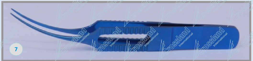
SCLERO-CORNEAL FORCEPS. CURVED SHAFT WITH 1 X 2, 0.12 mm TEETH. OVERALL LENGTH 86 mm. FLAT PERFORATED BODY. 6 mm TYING PLATFORM. (CL-TF - 001).