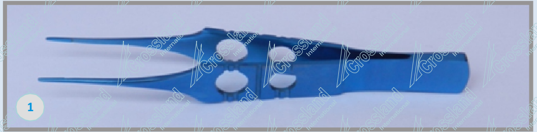
TYING FORCEPS. OVERALL LENGTH 86 mm. 6 mm TYING PLATFORM. FLAT TWO HOLE BODY. (CL-TF - 016).