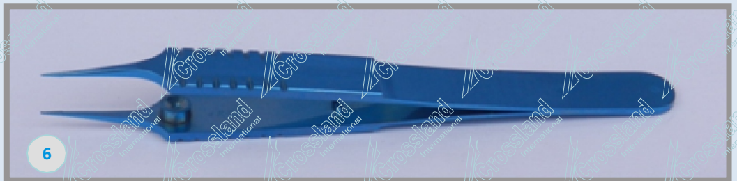
BONN IRIS FORCEPS. Long handle. EXCLUSIVELY DESIGNED, SERRATION ON THE EDGE OF THE HANDLE. OVERALL LENGTH 97 mm. BROAD 11 mm WIDE FLAT PERFORATED HANDLE FOR FIRM GRIP. 1 X2, 0.12 mm TEETH. (CL-TF - 009).