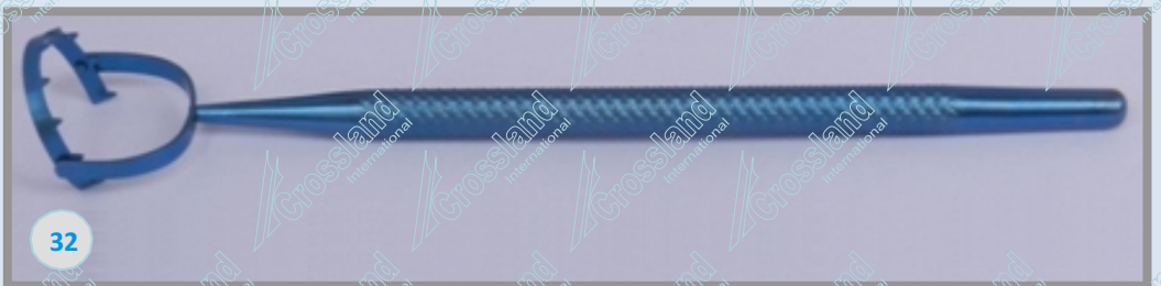
THORNTON FIXATION RING. "C" STYLE FIXATION RING. KNURLED SWIVEL HANDLE. 13 mm, HANDEL WITH A-TRAUMATIC TEETH FOR GLOBE FIXATION. (CL-MNT-030).