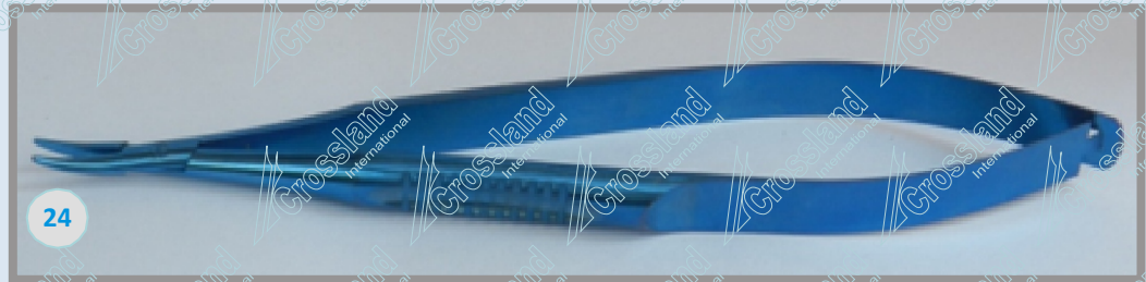
BARRAQUER NEEDLE HOLDER. OVERALL LENGTH 117 mm. FINE 11 mm JAW. POLISHED FINISH. ROUND SERRATED BODY. (CL-NHT-021).