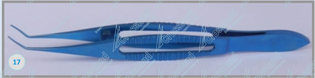
LENS HOLDING FORCEPS. FOR HOLDING & INSERTING FOLDABLE IOL. OVERALL LENGTH 118 mm. SERRATED, PERFORATED POLISHED BODY. (CL-TF - 005).