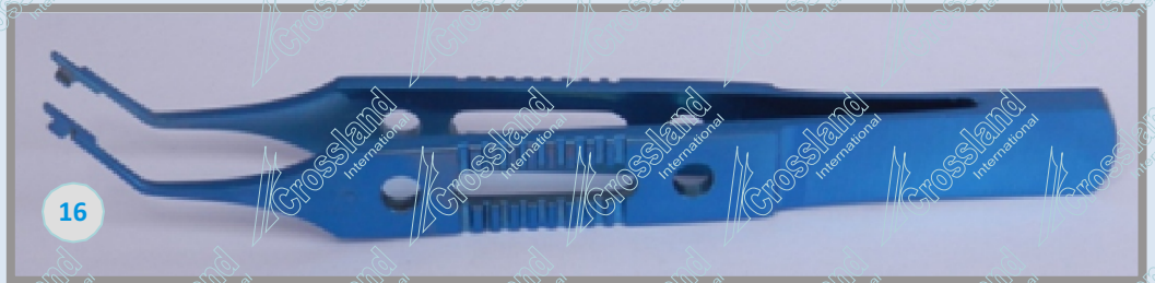
FOLDER FORCEPS. FORCEPS FOR FOLDING SOFT IOL. OVERALL LENGTH 117 mm. (CL-TF - 019).