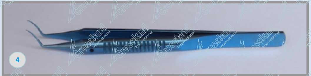
CAPSULORHEXIS FORCEPS. OVERALL LENGTH 115 mm. CURVED SHAPED SHAFT LENGTH 11 mm. DELICATE CYSTOTOME SHAPED TIP 0.2 mm. ROUND SERRATED LONG BODY. (CL-TF - 013).