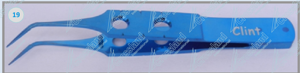
Mc PHERSON FORCEPS. OVERALL LENGTH 84 mm ANGLED SHAFT. LONG 11 mm TYING PLATFORM. TWO HOLE BODY, SPECIALLY DESIGNED, SERRATION ON THE SIDE OF THE BODY. (CL-TF - 014).