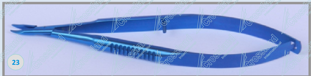
St. MARTIN FORCEPS. OVERALL LENGTH 85 mm 1 X 2 TEETH 6 mm TYING PLATFORM. FLAT SERRATED HANDLE. STRAIGHT SHAFT. (CL-TF- 032).