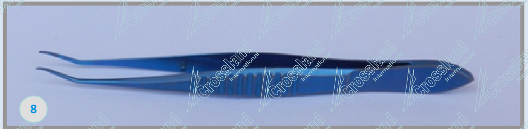
LIMS FORCEPS. OVERALL LENGTH 83 mm. 3.5 mm TYING PLATFORM. 1 X 2, 0.12 mm TEETH ON THE TIP OF VAULTED SHAFT. SERRATED FLAT SLIM BODY. (CL-TF - 003).