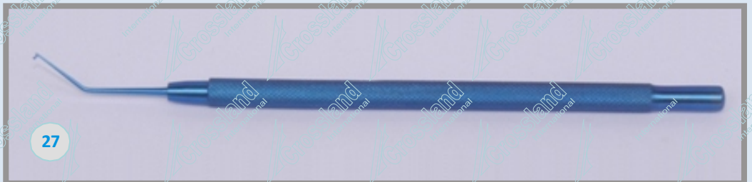
LESTER HOOK. 0.2 mm. TEAR DROP SHAPED TIP FOR DIALING IOL WITH OR WITHOUT HOLE. ROUND KNURLED BODY. (CL-MNT-025).