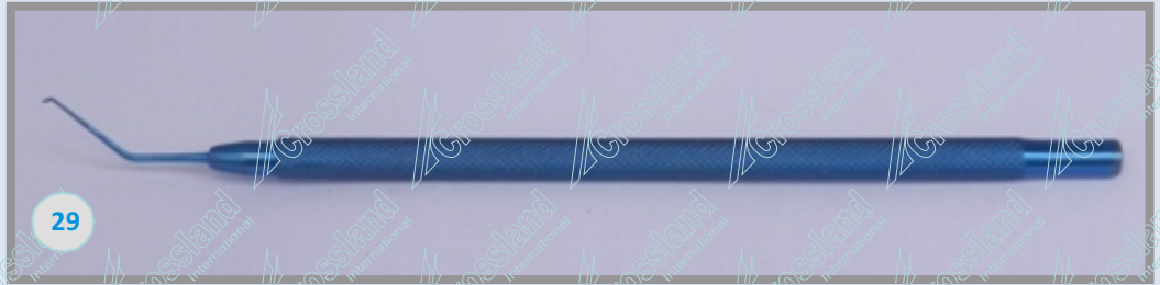
PHACO CHOPPER. PHACO CHOP WITH 1 mm. LONG SHARP TIP. (CL-MNT-027).