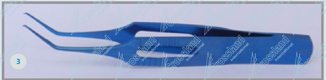
UTRATA CAPSULORHEXIS FORCEPS. OVERALL LENGTH 99 mm. ANGLED STRAIGHT SHAFT LENGTH 13 mm. DELICATE CYSTOTOME SHAPED TIP 0.2 mm. (CL-TF - 007).