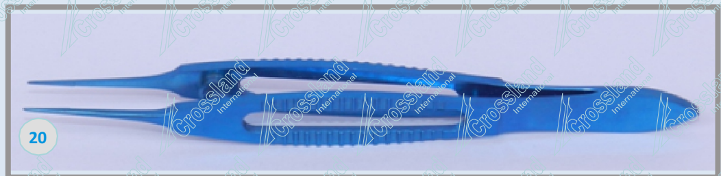
TYING FORCEPS. 8 mm TYING PLATFORM. OVERALL LENGTH 100 mm. SERRATED, PERFORATED POLISHED BODY. (CL-TF - 020).