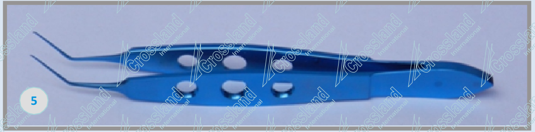
UTRATA CAPSULORHEXIS FORCEPS. OVERALL LENGTH 100 mm. ANGLE STRAIGHT SHAFT LENGTH 11 mm. DELICATE CYSTOTOME SHAPED TIP 0.2 mm. (CL-TF - 012).