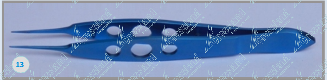
TYING FORCEPS. STRAIGHT, FLAT THREE HOLE BODY. 100 mm OVERALL LENGTH. 6 mm TYING PLATFORM. (CL-TF- 011).