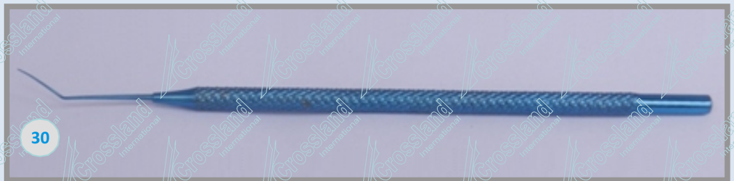
IRIS REPOSITOR. FLAT 1 mm. THICK 11 mm LONG ANGLED SHAFT. (CL-MNT-028).