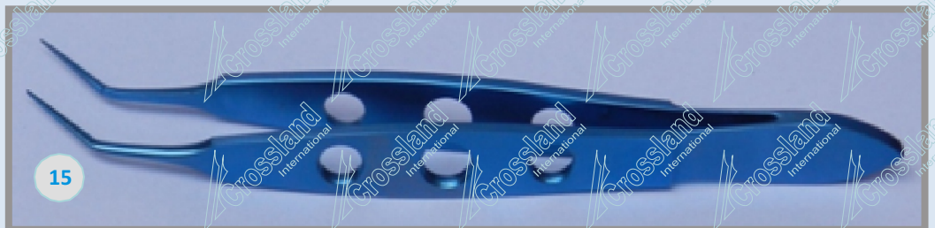
KELMAN Mc PHERSON FORCEPS. OVERALL LENGTH 100 mm. ANGLED SHAFT. 8 mm TYING PLATFORM. (CL-TF- 015).