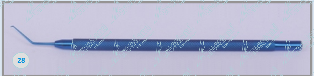
SINSKEY DIALING HOOK. LENS MANIPULATOR. 0.2 mm. DIAMETER. ROUND KNURLED BODY. (CL-MNT-026).