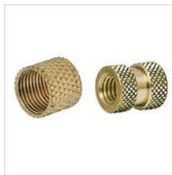
KNURLING BRASS INSERT