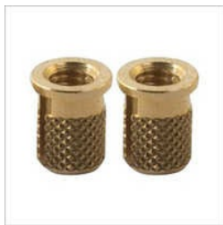
ROUND THREADED BRASS INSERTS

Allen Bolt, Brass Hex Bolts, Brass Hexagonal Nut, Brass M6 Hexagonal Nut, Brass Round Bushes, Brass Threaded Knurling Insert, Brass Wedge Anchor Bolt, Clinch Threaded Stud, Compact Spherical Washer, Dome Hexagonal Nut, Flat Head Slotted Machine Screw, Galvanized Mild Steel Bolt Nut, Galvanized Mild Steel Hex Bolt, Knurling Brass Insert, MS Tip Zinc Plating Drilling Screw, etc.