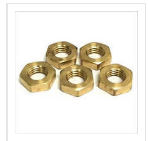
Brass Hexagonal Nut