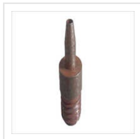
MS Tip Zinc Plating Drilling Screw