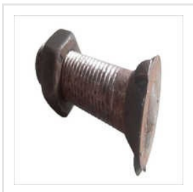
Round Countersunk Nib Nut Bolt