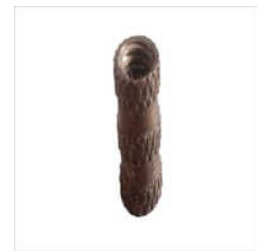
BRASS THREADED KNURLING INSERT