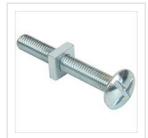
Roofing Carriage Bolt