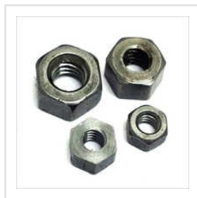
Metal Hexagonal Nut