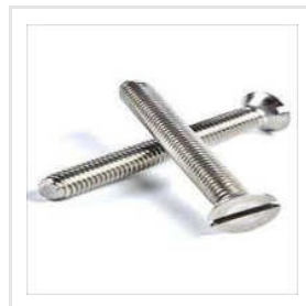
Flat Head Slotted Machine Screw