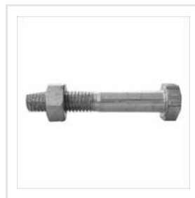
Galvanized Mild Steel Bolt Nut