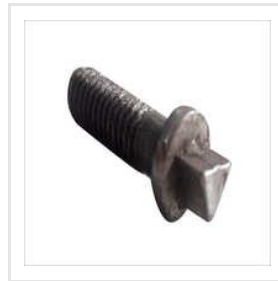
Tri Head Bolt