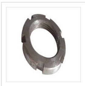
Precision Lock Nut