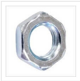
Mild Steel Hexagonal Nut