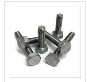
Mild Steel Hex Bolt