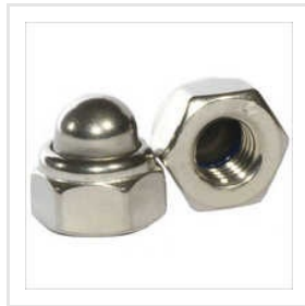
Dome Hexagonal Nut