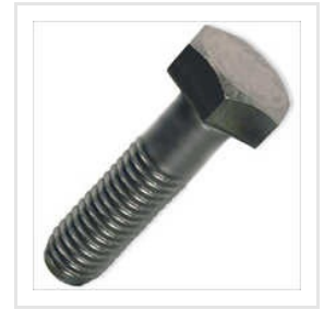
Galvanized Mild Steel Hex Bolt