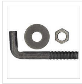
Mild Steel Foundation Bolts