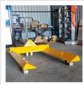
Hydraulic Paper Reel Pallet Truck