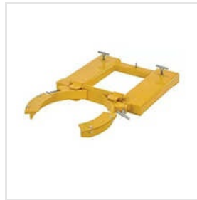
Drum Gripper Attachment