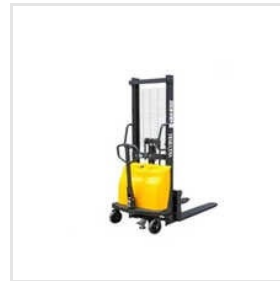
Semi Electric Lifting Stacker 2