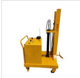
Semi Electric Counter Balance Drum Lifter