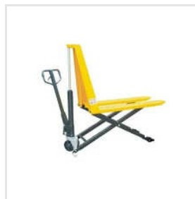
High Lift Scissor Pallet Truck