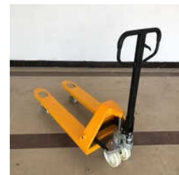
2.5 TON HAND PALLET TRUCK