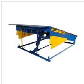
Hydraulic Dock Leveler