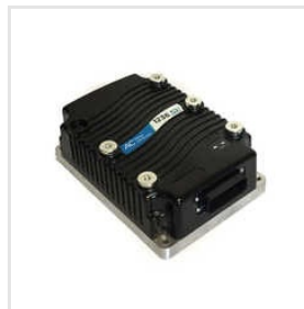
1236-5401 Curtis Controller