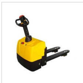
Battery Operated Pallet Truck