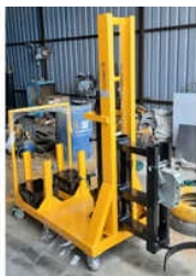
COUNTER BALANCE MANUAL DRUM LIFTER

50 A Anderson Battery Connector, Blue Spot LED Light, Commercial Carpet Cleaning Service, Curtis Albright Contactor, Curtis Audible Alarm, Curtis Battery Discharge Indicator, Curtis Foot Pedal, Emergency Battery Disconnect Switch, File Cup Board, Forklift Fuse, Hand Pallet Truck Hydraulic Pump, High Lift Scissor Truck, Hydraulic Scissor Lift, Industrial Drive Wheel, Industrial Drum Gripper Attachment, etc.