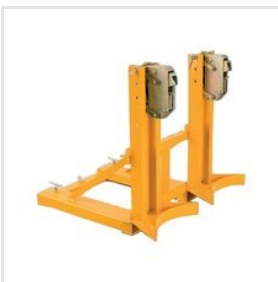
Double Drum Attachment