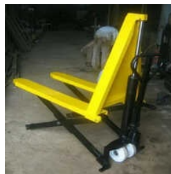
MANUAL SCISSOR LIFT PALLET TRUCK