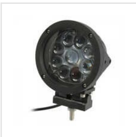
Led Overhead Crane Warning And Safety