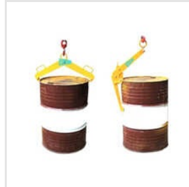
Hook Mounted Drum Lifter