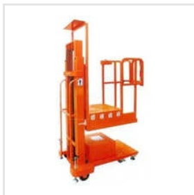
Semi Electric Hydraulic Order Picker