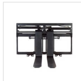
Cascade Fork Positioner