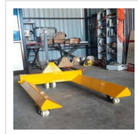
Hydraulic Paper Reel Pallet Truck