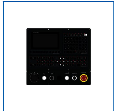
CNC MACHINE CONTROLLER