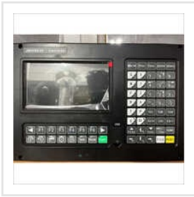
Ad Tech 9620 CNC Controller