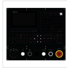
CNC Machine Controller