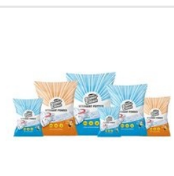
Export Quality Detergent Powder 100