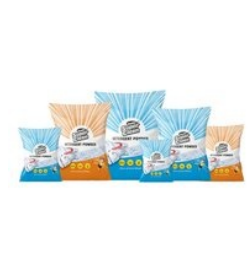
Spray Dried Detergent Powder Export Quality