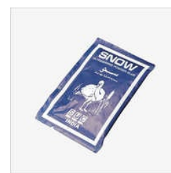
UM5 ULTRAMARINE POWDER BLUE