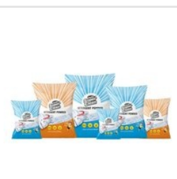
Spray Dry Detergent Powder