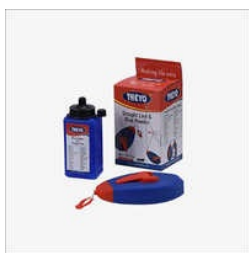
Chalk Line Reel Bath Powder