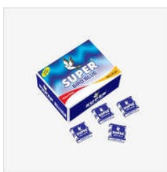
ULTRAMARINE BLUE TABLET AND CUBES