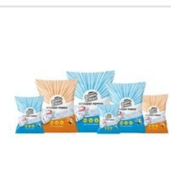
Spray Dry Detergent Powder 5 Kg