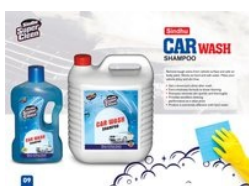
Car Wash Shampoo