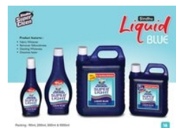
Ultramarine Blue Liquid