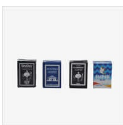
UM7 Ultramarine Blue