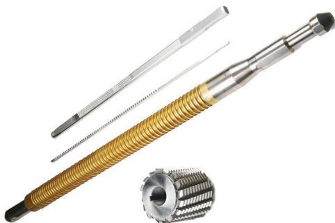
SOLID CARBIDE TOOLS