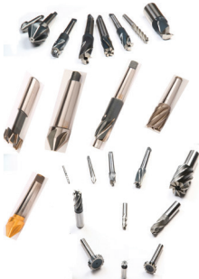
HSS MILLING CUTTERS