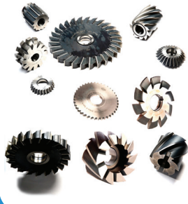
HSS MILLING CUTTERS