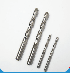
"Hurricane" HARDWARE DRILLS