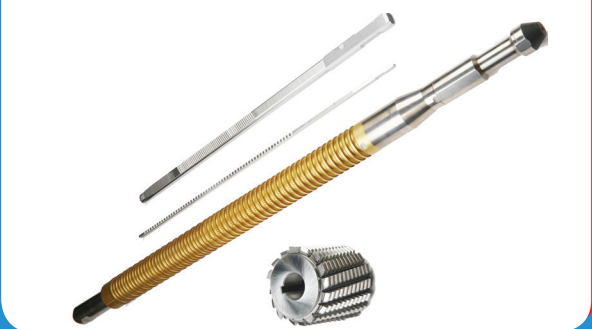
HSS BROACHES & HOBS