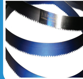
ADDISON ® BI-METAL BAND SAW BLADES