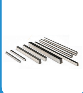
HSS TOOL BITS