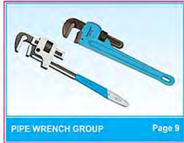
PIPE WRENCH GROUP Page 9