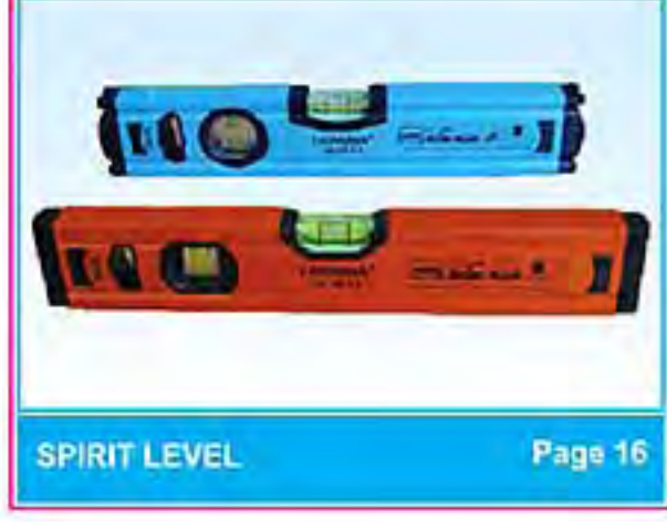
SPIRIT LEVEL Page 16