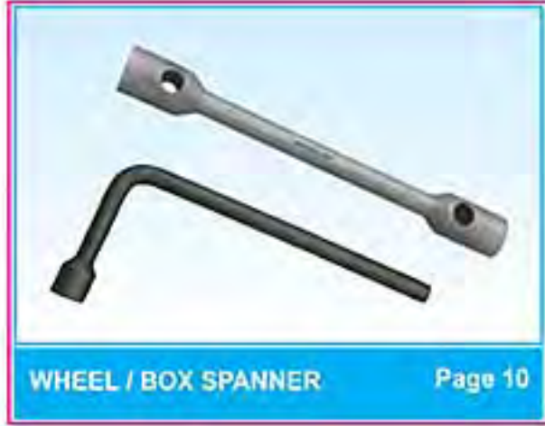
WHEEL / BOX SPANNER Page 10