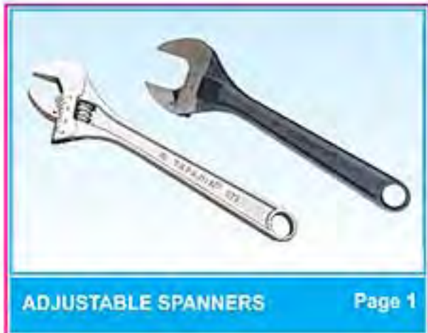
ADJUSTABLE SPANNERS Page 1