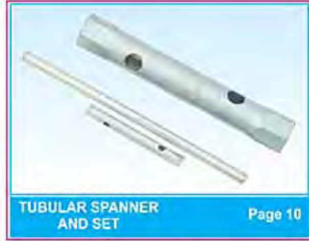
TUBULAR SPANNER AND SET Page 10