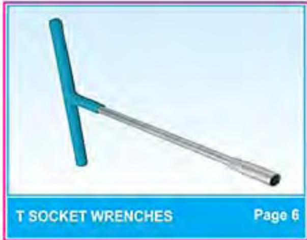
T SOCKET WRENCHES Page 6