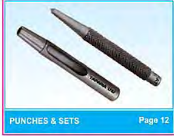
PUNCHES & SETS Page 12