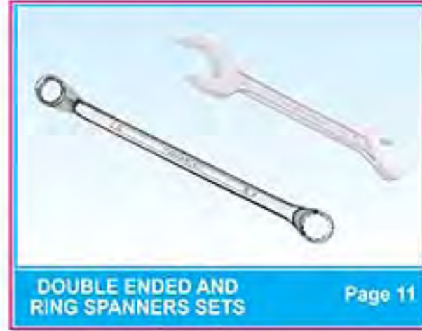
DOUBLE ENDED AND RING SPANNERS SETS Page 11