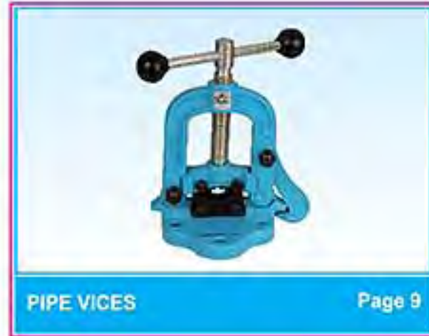
PIPE VICES Page 9