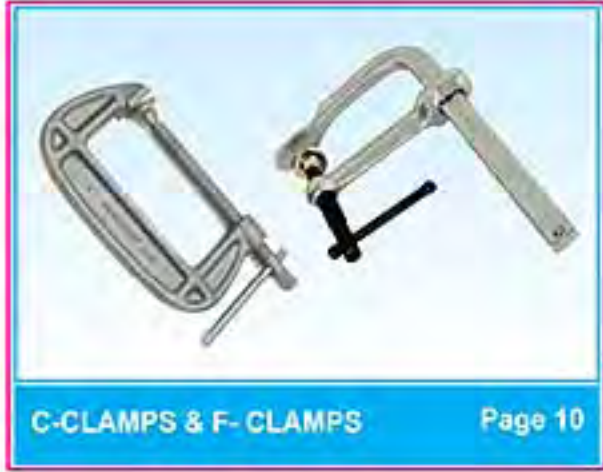
C-CLAMPS & F- CLAMPS Page 10