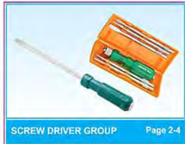
SCREW DRIVER GROUP Page 2-4