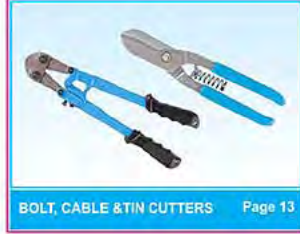
BOLT, CABLE & TIN CUTTERS Page 13