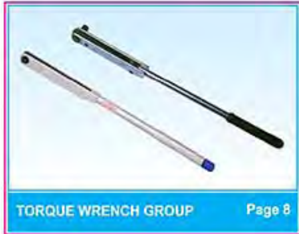
TORQUE WRENCH GROUP Page 8