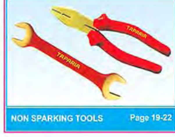
NON SPARKING TOOLS Page 19-22