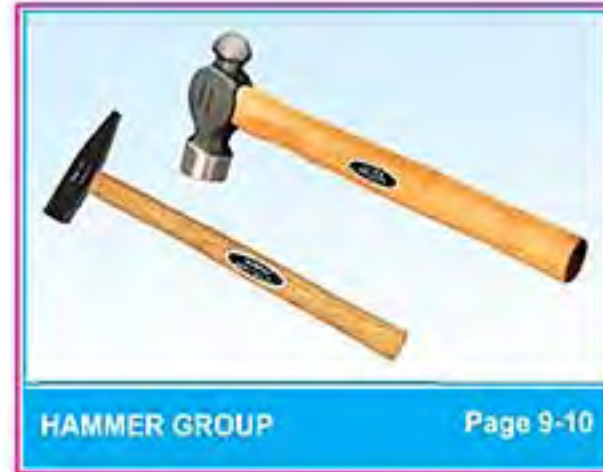
HAMMER GROUP Page 9-10