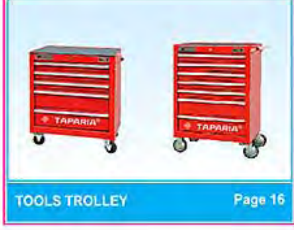
TOOLS TROLLEY Page 16