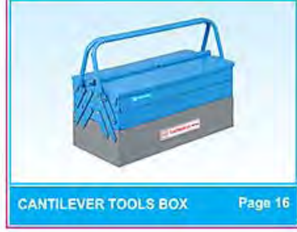
CANTILEVER TOOLS BOX Page 16