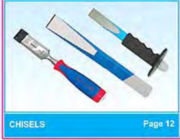
CHISELS Page 12