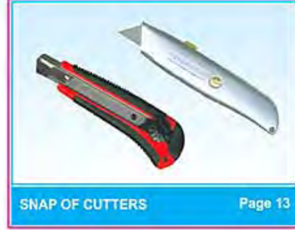
SNAP OFF CUTTERS Page 13