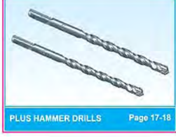
PLUS HAMMER DRILLS Page 17-18