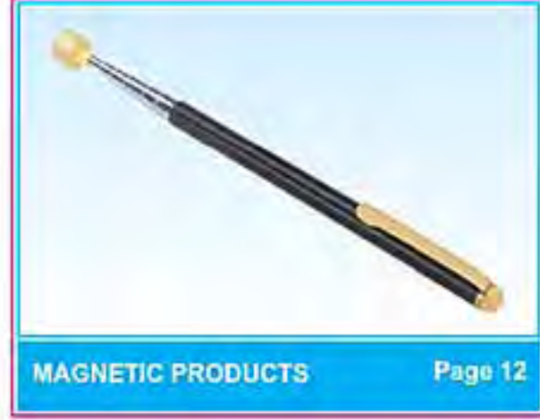
MAGNETIC PRODUCTS Page 12