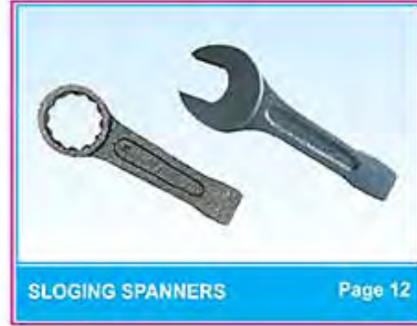
SLOGGING SPANNERS Page 12