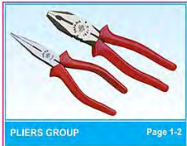
PLIERS GROUP Page 1-2