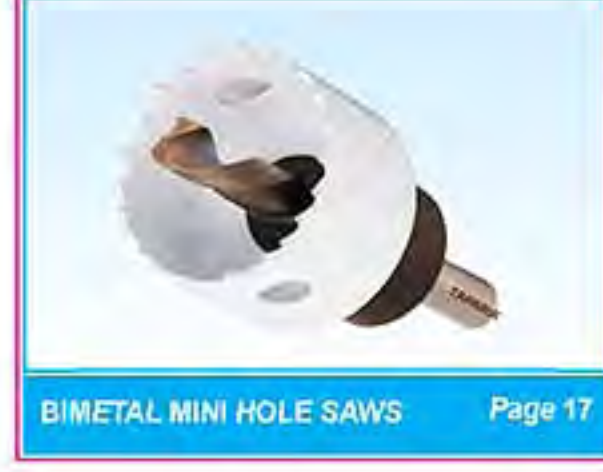
BIMETAL MINI HOLE SAWS Page 17