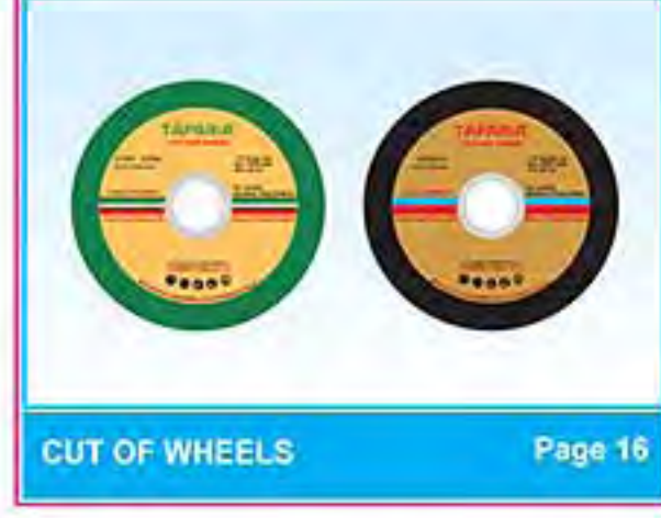
CUT OFF WHEELS Page 16