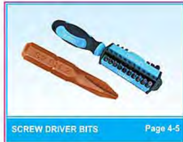
SCREW DRIVER BITS Page 4-5