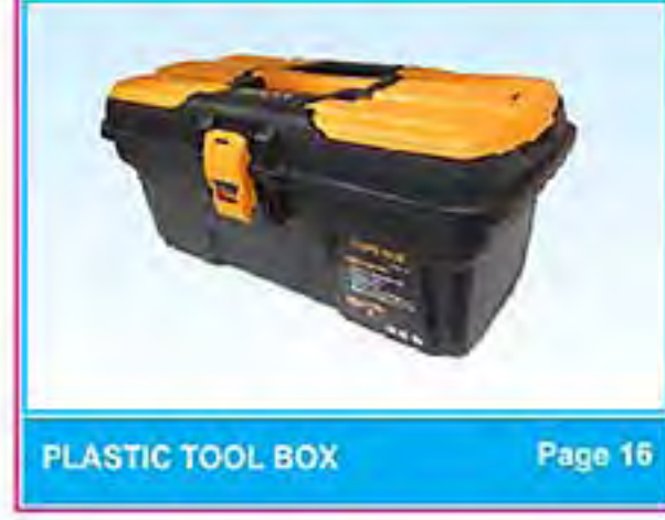
PLASTIC TOOL BOX Page 16