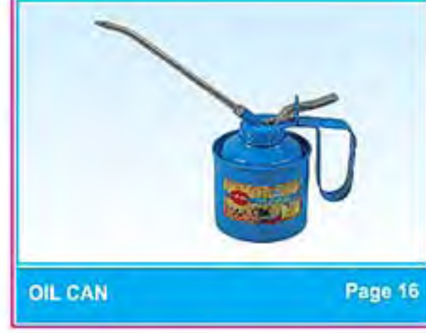
OIL CAN Page 16