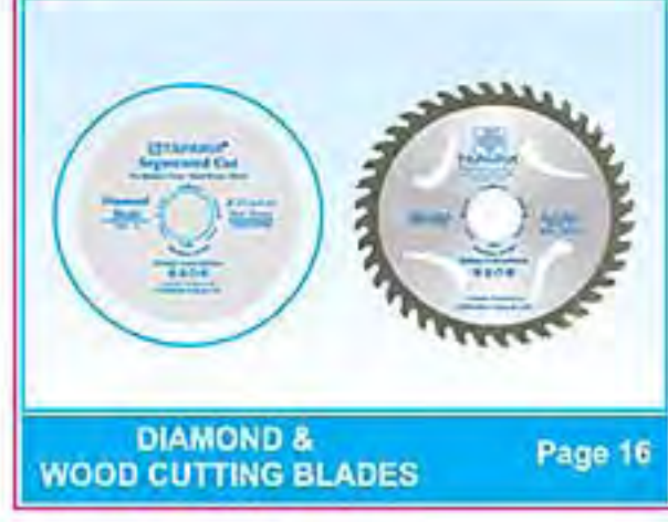
DIAMOND & WOOD CUTTING BLADES Page 16