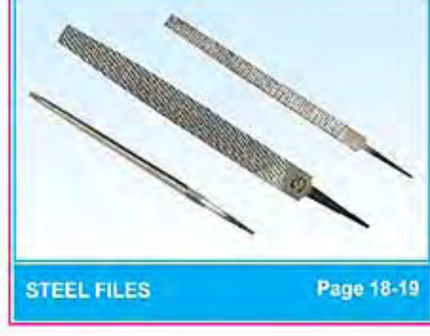
STEEL FILES Page 18-19