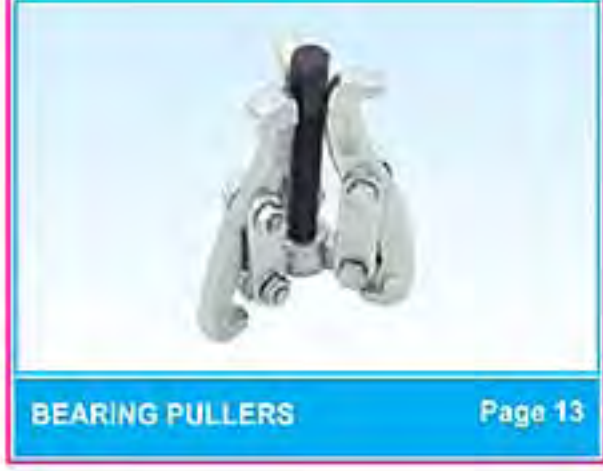
BEARING PULLERS Page 13