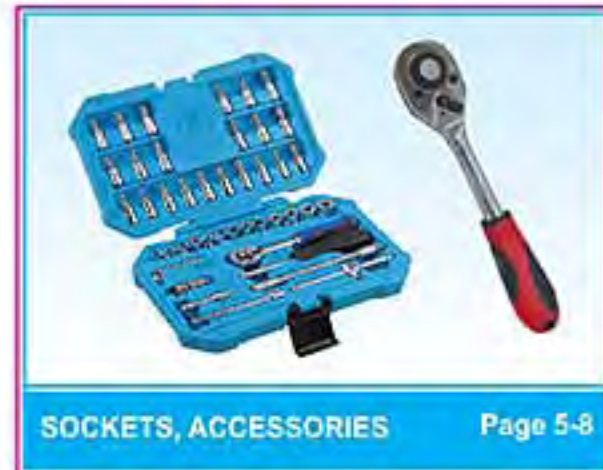
SOCKETS, ACCESSORIES Page 5-8