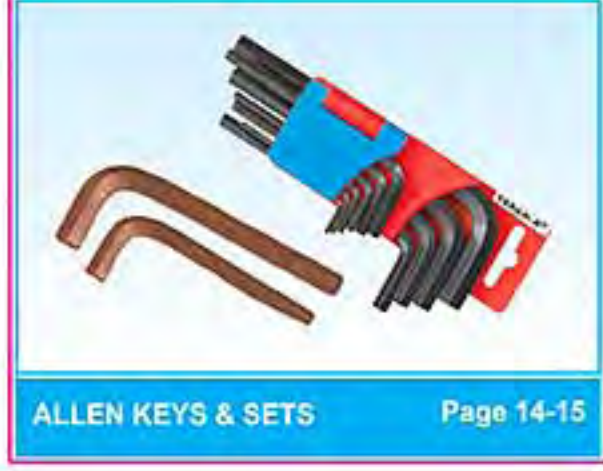
ALLEN KEYS & SETS Page 14-15