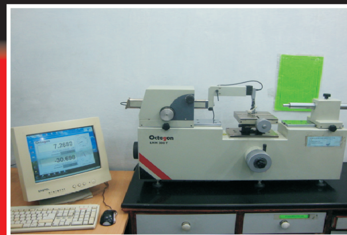
Octagon - Length Measuring Machine for internal & external measurement - LMM 100T & LMM 300T.