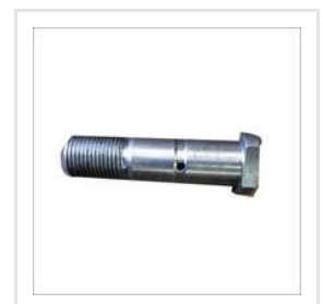
20MNCr5 Small Bell Crank Pin