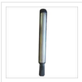
Shaft ARGO 4000 Drum Gear Box