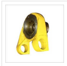
Kan Drum Mounting