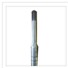
Shaft ARGO 2000 Drum Gear Box