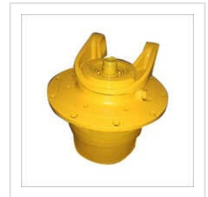
EN353 Drum Gear Box