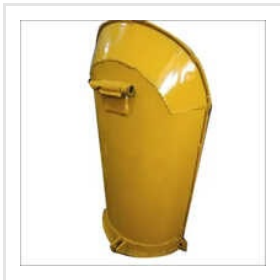
Mild Steel A2 Fix Shut