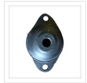
Cabin Mounting For Tata