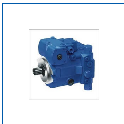
ARGO 2000 REXROTH HYDRAULIC PUMPS

200 psi 3 Way Valve, 20MNCR5 Big Bell Crank Pin, 20MNCR5 Small Bell Crank Pin, 220 V Drum Gear Box Motor, A2 Air Filter, A2 Kirloskar Silencer, A2 Silencer, Argo 2000 Rexroth Hydraulic Pumps, Big Bucket Pin, Brack Light Cover, Cabin Mounting For Tata, Drum Argo 2000 Cement Concrete Mixer, EN353 Drum Gear Box, Housing Aluminum Coupling Set, Hydraulic Return Line Filters, etc.