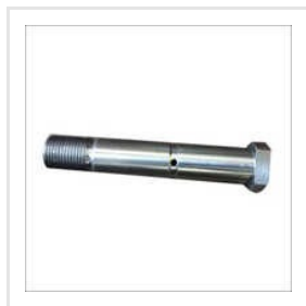
20MNCr5 Big Bell Crank Pin