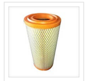
Kirloskar Air Filter