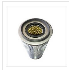
A2 Air Filter