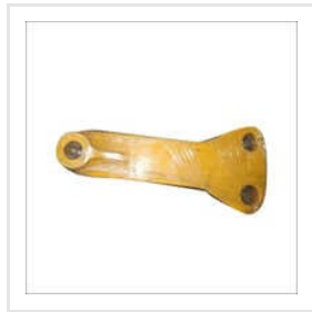
Mild Steel A2 Bell Crank