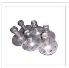
MS Small Bucket Pin