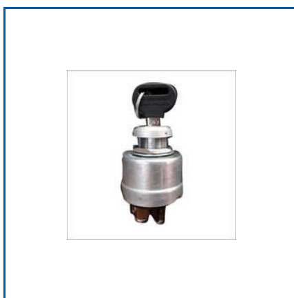
MS ON OFF A2 SWITCH