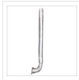
A2 Kirloskar Silencer