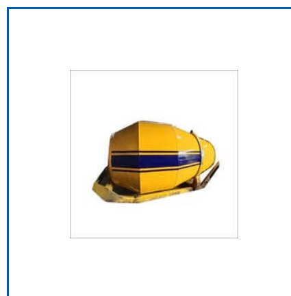
DRUM ARGO 2000 CEMENT CONCRETE MIXER