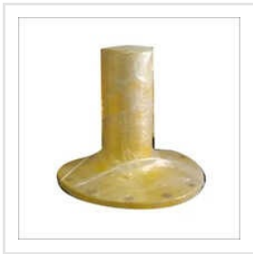
Big Bucket Pin