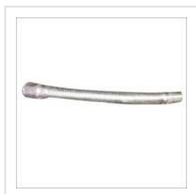
Mild Steel Ajax Fiori Silencer