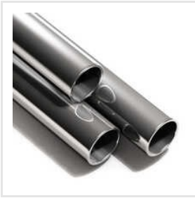
Carbon Manganese Steel Honed Tube