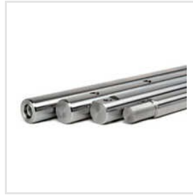
Carbon Steel Linear Motion Shaft