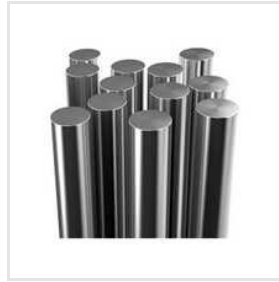
Mild Steel Induction Hardened Rod