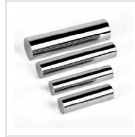
Stainless Steel Hard Chrome Plated Piston