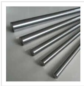
Industrial Hard Chrome Plated Rod