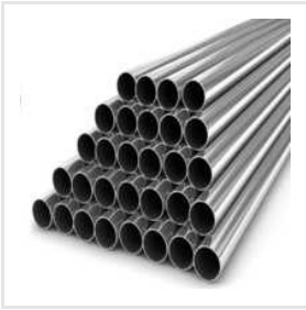
ST52 Carbon Manganese Steel