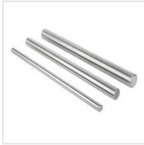
EN-19 Carbon Steel Linear Motion Shaft