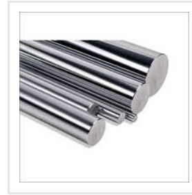
Induction Hardened Hard Chrome Plated