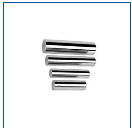
STAINLESS STEEL HARD CHROME ROD