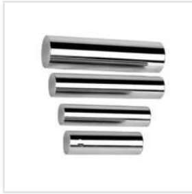
Stainless Steel Hard Chrome Rod