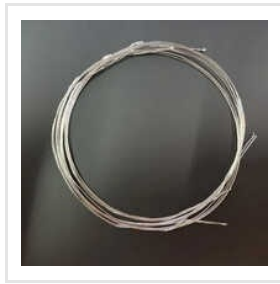
Pure Platinum Wire - Varied Diameters