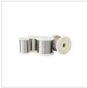
Platinum Rhodium Bare Wires