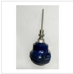
J Type Thermocouple