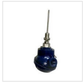
PT500 Temperature Sensor