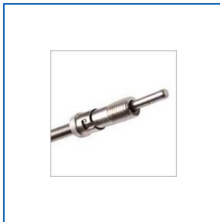
K TYPE THERMOCOUPLE