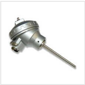
Stainless Steel Temperature Sensor