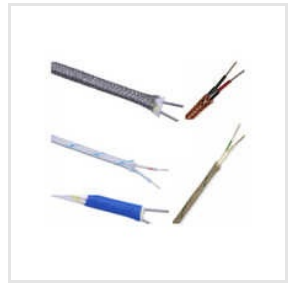
Thermocouples And RTD Cable