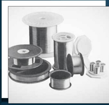
PLATINUM RHODIUM BARE WIRES