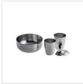
Pure Platinum Crucibles