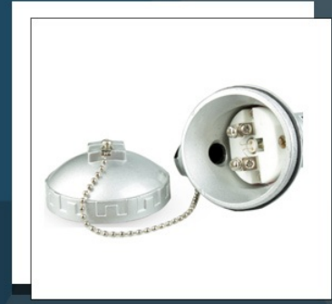
'S' TYPE THERMOCOUPLE

B Type Thermocouple, Bobbin Heaters Porcelain Heaters, Cables for Thermocouples and Rtds, Cartridge Heaters, Ceramic Tube, Ceramic Tube - 610 Quality, One End Closed, Ceramic Tube Thermocouple, Ceramic Tubes - Both end open, Ceramic Tubes Thermocouples, Finned Heaters, Immersion Heater, Immerssion Heaters, J Type Thermocouple, K Type Thermocouple, etc.