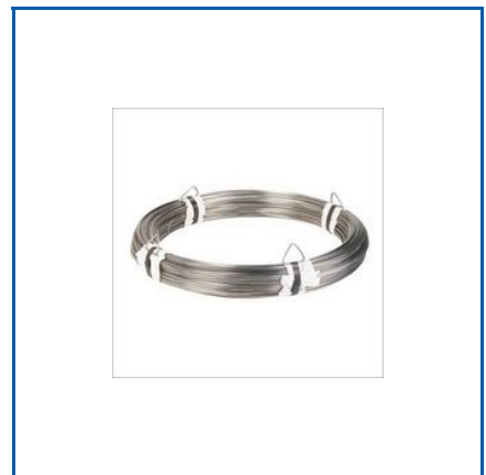
RESISTANCE WIRE AND STRIPS