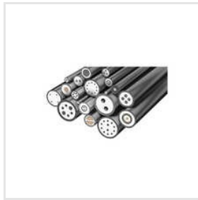
Mineral Insulated Cables For