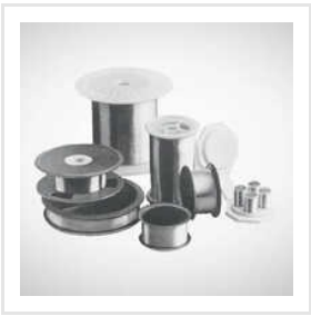
S Type Platinum Rhodium Bare Wire