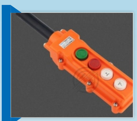
Remote Push Button Cob 61a