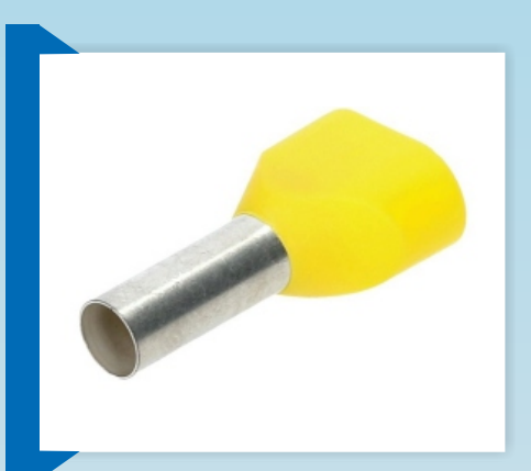
End Cord Terminal Twin 10mm