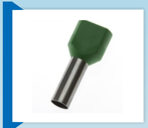
End Cord Terminal Twin 6mm