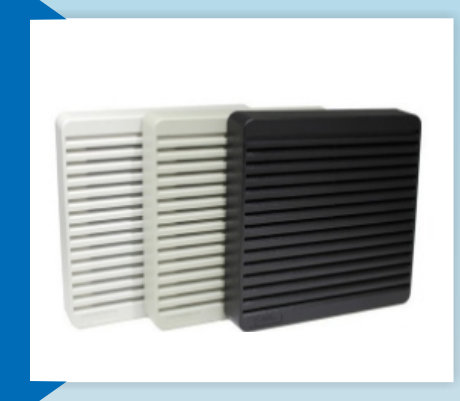
Air Vents 4 Inch Screw Fit