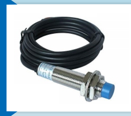
Proximity Sensor Pnp No 30mm