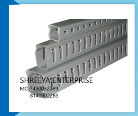
Electrical Channel Pvc Channel H45 X W25