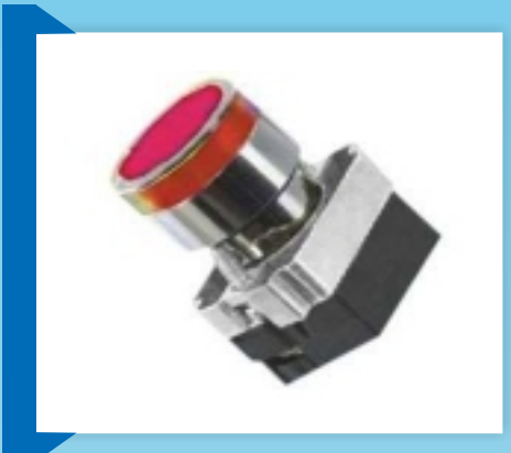
Control Panel Illuminated Push Button