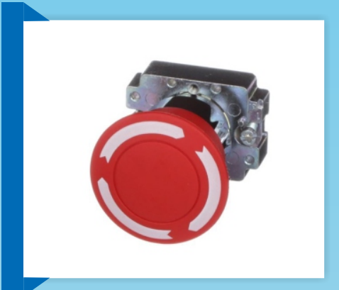
Control Panel Emergency Stop