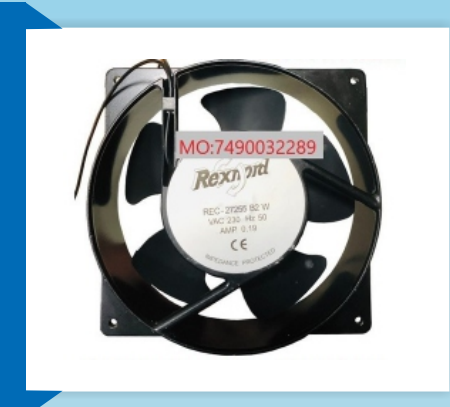
REC-27255 B2 W 6 INCH