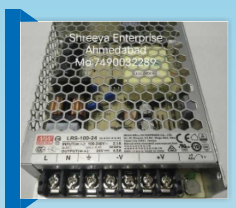
Switch Mode Power Supply LRS 100-24