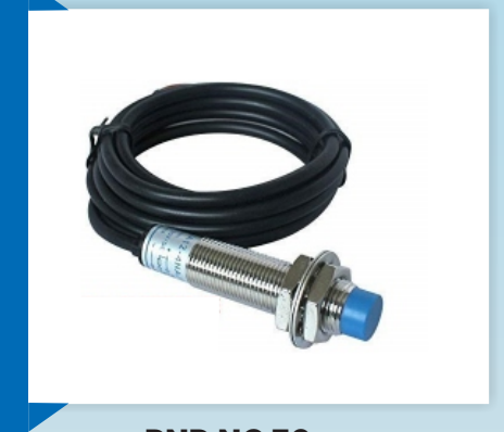
PNP NC 30mm