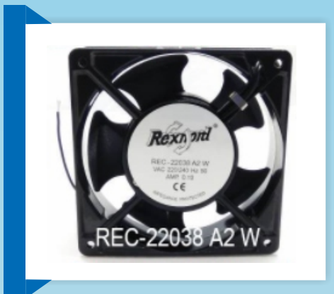
REC-22038 A2 W (4")