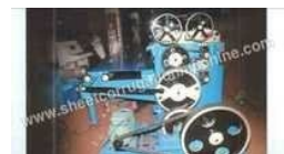
SHEET METAL CORRUGATION MACHINE