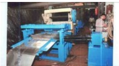
Automatic Cut To Length Machine