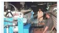
SHEET CORRUGATION MACHINE

Automatic Cut To Length Machine (ACTLM), Automatic Cut to Length Plant, Decoiler Shaft, Galvanized Sheet Corrugation Machines, Manual Cut to Length Machine, Pinch Roll, Run Out Conveyor, Sheet Corrugation Machine, Sheet Metal Corrugation Machine, Straightening Machine, etc.