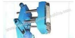
Automatic Cut To Length Plant