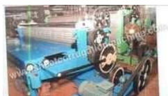
GALVANIZED SHEET CORRUGATION MACHINES