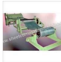
Manual Cut To Length Machine