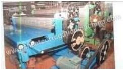
Galvanized Sheet Corrugation Machines