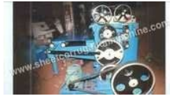
Sheet Metal Corrugation Machine