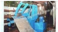
Run Out Conveyor