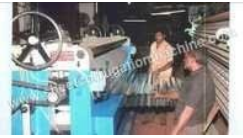
Sheet Corrugation Machine