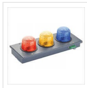
DSL Indicator Lamp