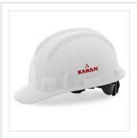
Plastic Safety Helmet