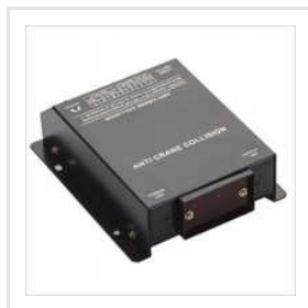
Anti Crane Collision