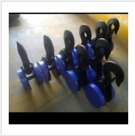
Bottom Hook Assembly