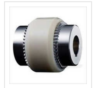
Nylon Gear Coupling