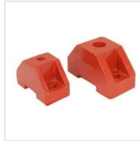
DSL Insulator Heavy