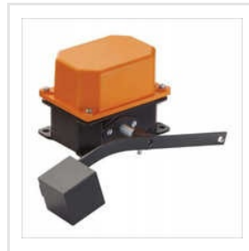
Gravity Counter Weight Limit Switch