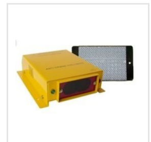
Anti Collision Device