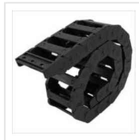
Cable Drag Chain