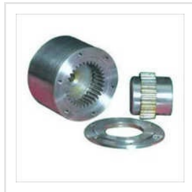
Brake Drum Coupling