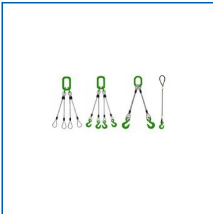
WIRE ROPE SLINGS

AC Drive, AC Electric Motor, Ac Disc Brake, Ac Solenoid Brake, Air Breather Plug, Anti Collision Device, Anti Crane Collision, Bottom Hook Assembly, Brake Drum Coupling, C Rail - Couplers - Clamp, C Rail System, C Rail Trolley, Cable Carrier, Cable Drag Chain, Cable Relling Drum, etc.