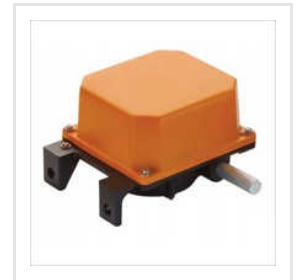
Rotary Geared Limit Switch