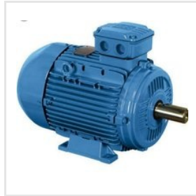
AC Electric Motor