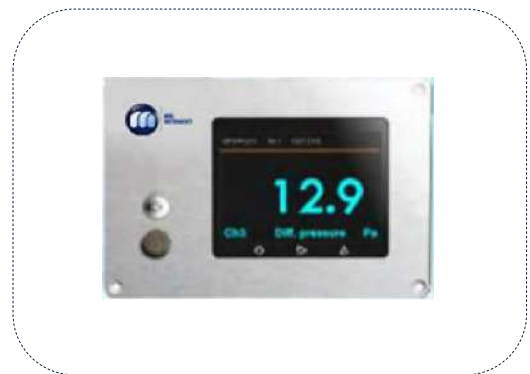
Multifunctional room pressure monitor

Data centers and networking rooms house sensitive electronic equipment that requires specific environmental conditions to operate efficiently and avoid overheating. The MIRM Multifunction Room Pressure Monitor helps maintain ideal temperature and humidity levels, ensuring the reliability and longevity of servers and other equipment. Whether it's servers in data centers or networking equipment, The MIRM Multifunction Room Pressure Monitor assists in maintaining the necessary conditions to prevent equipment failure and data loss.