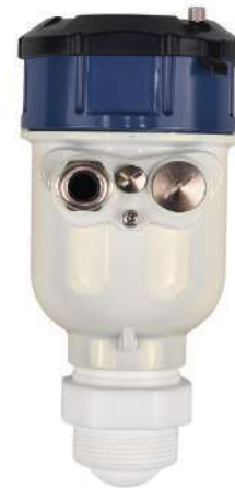
MRL – Mial radar Level Meter

Bulk Storage Systems: Enhances measurement accuracy in large bulk storage tanks, ensuring reliable monitoring of material levels in various industries