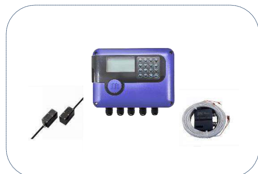
MUF(B) 1200 (1%) Clamp on Ultrasonic Meter

For assessing the performance and efficiency of fluid systems, the MUF 1200/MUF(B) 1200 Clamp on Transit Time Ultrasonic Flow/Btu Meter delivers unmatched accuracy. Whether it's evaluating the effectiveness of pumps or monitoring regulating valves, this meter provides comprehensive insights. Its ability to measure both flow and thermal energy facilitates thorough performance assessments, enabling proactive maintenance and optimization strategies.