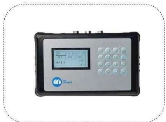
MUF 1000 Portable Clamp On Ultrasonic Flow Meter

The MUF 1000 can assist in the service and maintenance of flow systems by providing accurate flow data, conducting audits, evaluating system capacity, and monitoring the performance of pumps and regulating valves.