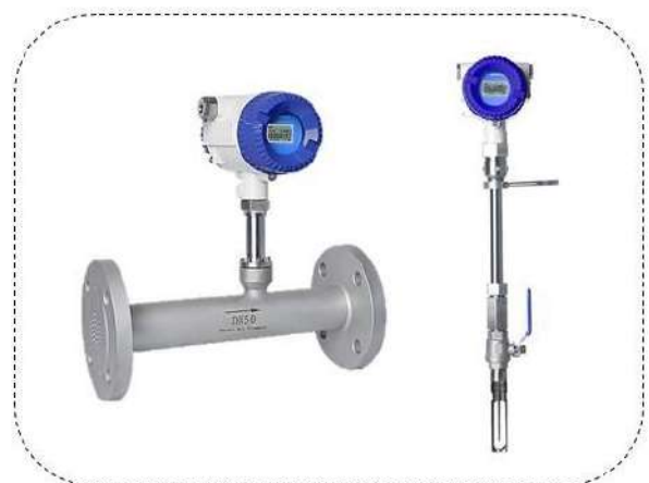
MTF 500 / 600 Thermal Mass Flow Meter

In aerospace and automotive industries, the MTF 500/600 can be employed for testing and validating gas flow in engines, propulsion systems, and aerodynamic research. Its rugged construction and precise measurement capabilities make it suitable for demanding testing environments.