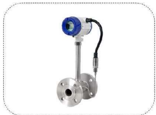
Vortex Fow Meter

Vortex flow meters in heat-supply systems accurately measure fluid flow rates, optimizing heat transfer efficiency. They monitor the flow of hot water or steam in heating networks, ensuring precise distribution and energy conservation. These meters offer reliability, low maintenance, and compatibility with high temperatures, essential for effective heat-supply system operation.