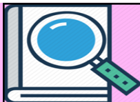
Free Text Search