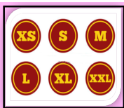
Automatic Billing of Item Groups