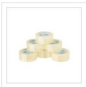
Adhesive Bopp Transparent Tape