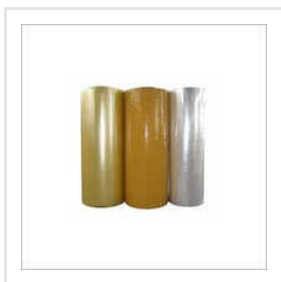
Bopp Jumbo Roll Tape