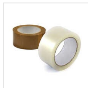
Industrial BOPP Tape