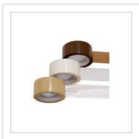
Bopp Packaging Tapes