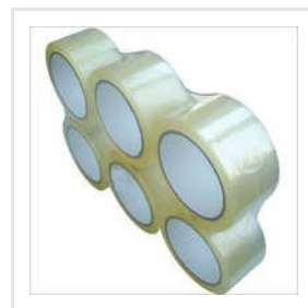
BOPP Transparent Packing Adhesive Tape