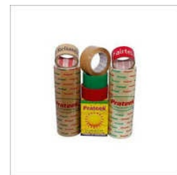
ADHESIVE PRINTED BOPP TAPE