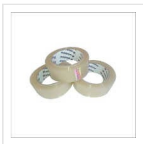
Transparent BOPP Adhesive Tape