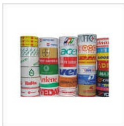
BOPP PRINTED SELF ADHESIVE TAPE