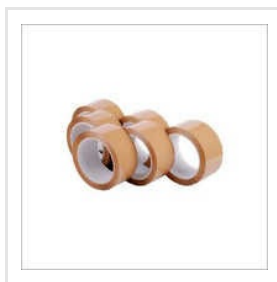
Brown Bopp Tape