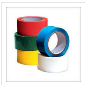
Colored Bopp Tapes