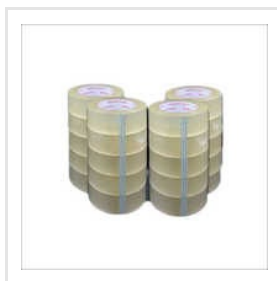
Strong Adhesive BOPP Tape