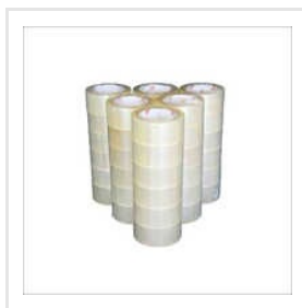
Industrial Bopp Transparent Tape