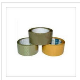
Smooth Texture Bopp Packing Tapes