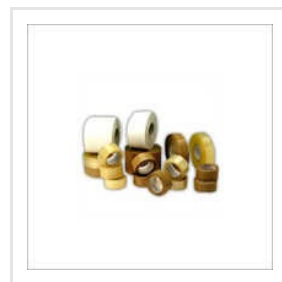
BOPP Adhesive Tapes