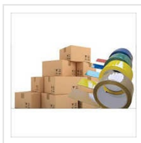
Strong Adhesive BOPP Packing Tapes