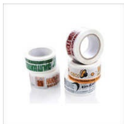
INDUSTRIAL BOPP PRINTED ADHESIVE TAPE

Acrilic Foam Tape, Adhesive Bopp Packing Tape, Adhesive Bopp Transparent Tape, Adhesive Printed BOPP Tape, Aluminum Scrim Karft Tape, Aluminum Tape, BOPP Adhesive Tapes, BOPP Transparent Packing Adhesive Tape, Bag Sealing Adhesive Tape, Bag Sealing Tape, Bitumen Tape, Bopp Jumbo Roll Tape, Bopp Packaging Tapes, Bopp Printed Self Adhesive Tape, Bopp Self Adhesive Tapes, etc.