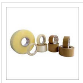
Bopp Self Adhesive Tapes