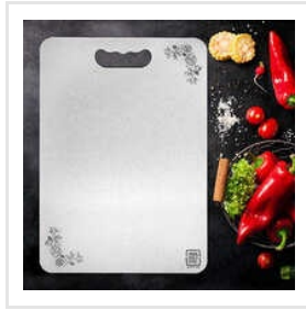
Stainless Steel Chopping Board For