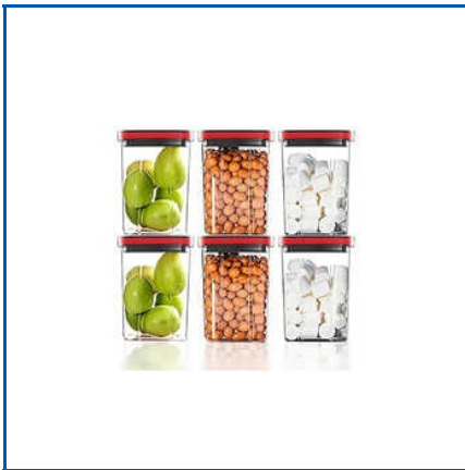
TWIST-LOCKING AIRTIGHT FOOD STORAGE KITCHEN CONTAINER SET

Fridge Storage Container For Food, Gas Stove Burner Stand, Glass Lifter Suction Cup For Lifting, Stainless Steel Chopping Board For Kitchen, Stainless Steel Clothes Hanger Multilayer Hanger, Twist-Locking Airtight Food Storage Kitchen Container Set, etc.