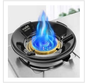
Gas Stove Burner Stand