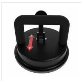
Glass Lifter Suction Cup For Lifting