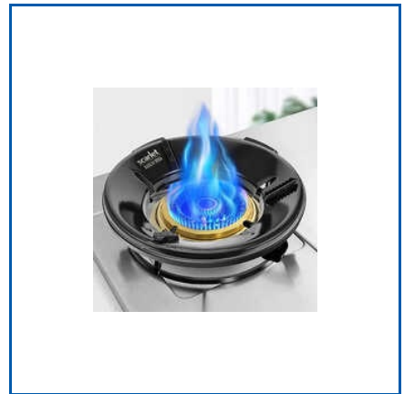
GAS STOVE BURNER STAND