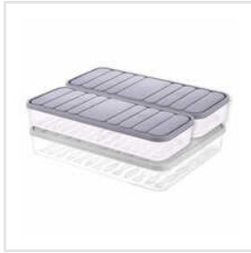
Fridge Storage Container For Food