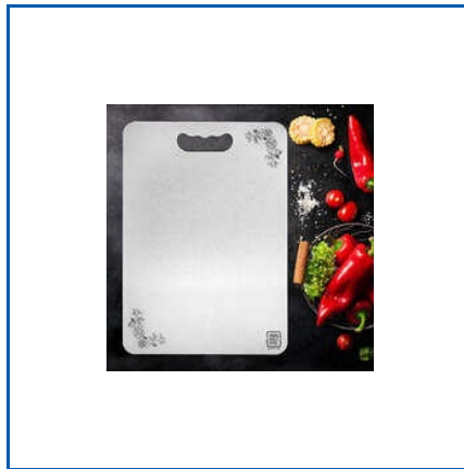
STAINLESS STEEL CHOPPING BOARD FOR KITCHEN