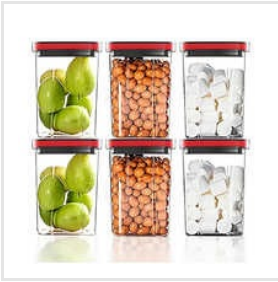
Twist-Locking Airtight Food Storage Kitchen