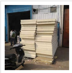
PUF Sandwich Panel