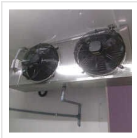
Cold Room Evaporator Unit