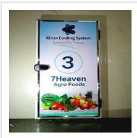
Cold Storage Room Door