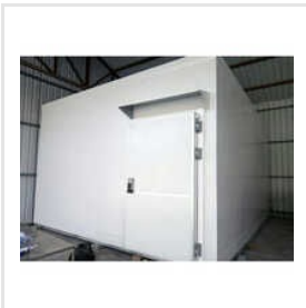
PPGI Cold Room