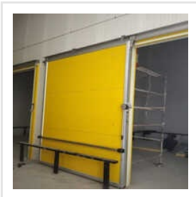
Cold Room Sliding Door