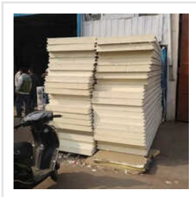
PUF Insulated Panels