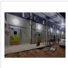
Industrial Cold Storage Plant