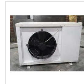
True Cold Condensing Unit