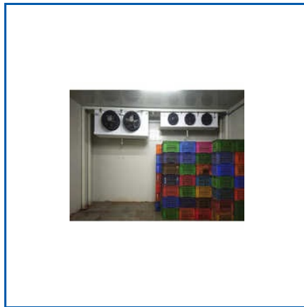
VEGETABLE COLD CONDENSING UNIT