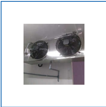
COLD ROOM EVAPORATOR UNIT

Banana Ripening Chamber, Cold Room Evaporator Unit, Cold Room Sliding Door, Cold Storage Room Door, Industrial Blast Freezer Unit, Industrial Cold Storage Plant, PPGI Cold Room, PUF Insulated Panels, PUF Sandwich Panel, True Cold Condensing Unit, Vegetable Cold Condensing Unit, etc.