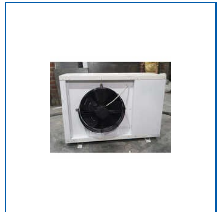
TRUE COLD CONDENSING UNIT