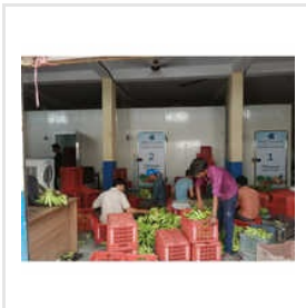
Banana Ripening Chamber