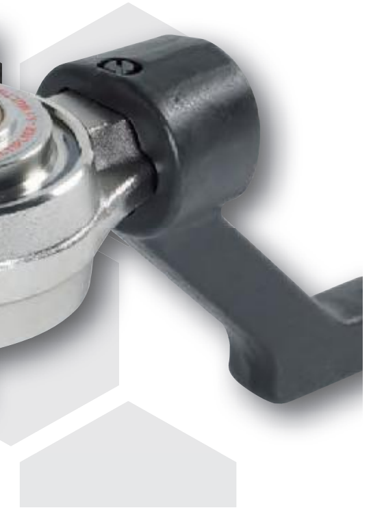
HT3 1300 N·m