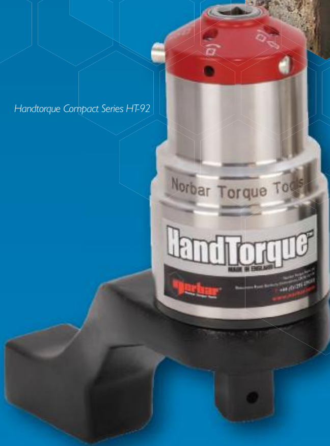
Handtorque Compact Series HT-92