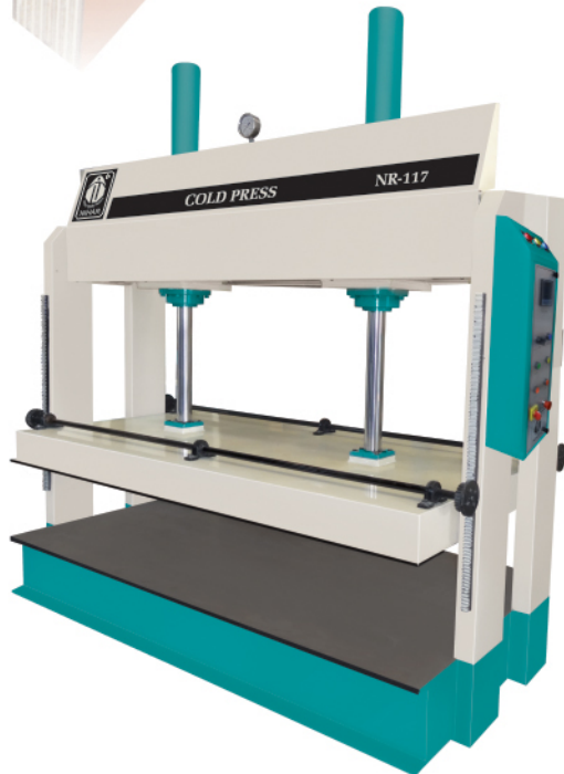
Cold Press (50 Ton)