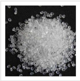
Reprocessed PP Granules