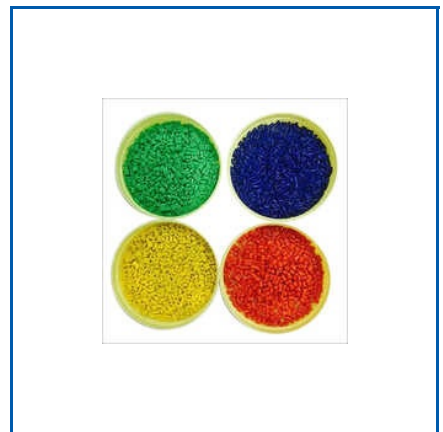
MULTICOLOURED POLY PROPYLENE GRANULES