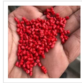
Red PolyPropylene Granules