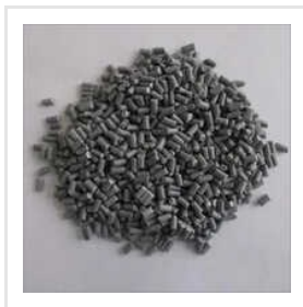
Grey Natural PP Granules