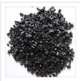
Jumbo Black PP Granules