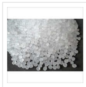
White Virgin PP Granules