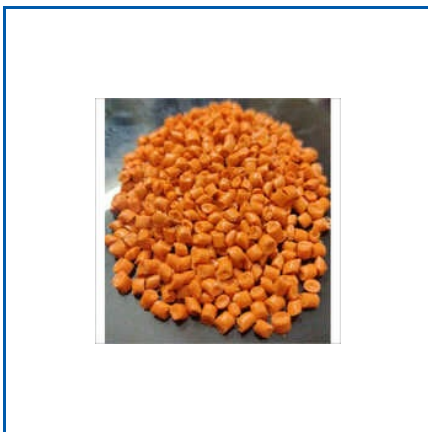
ORANGE POLY PROPYLENE GRANULES

99% Purity Grey PPCP Granules, Bio Polymers, Black PPCP Granules, Black Poly Propylene Granules, Brown PPCP Granules, Green PPCP Granules, Grey Natural PP Granules, Jumbo Black PP Granules, Multicoloured Poly Propylene Granules, Natural Blue PP Granules, Natural Green PP Granules, Natural Orange PP Granules, Natural Rose Pink PP Granules, Natural Yellow PP Granules, Orange Poly Propylene Granules, etc.