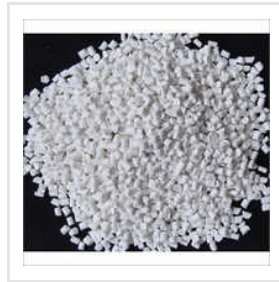
Reprocessed PP White Granules