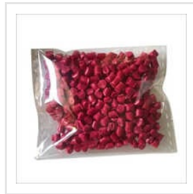
Natural Rose Pink PP Granules