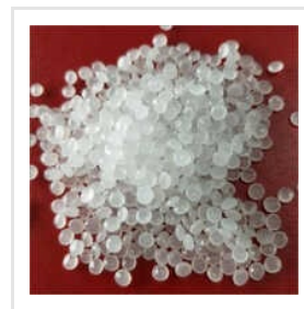
PP Raffia Transparent Granules