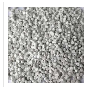
PP Milky Granules