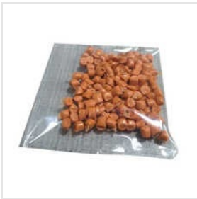
Natural Orange PP Granules