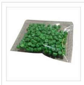
Natural Green PP Granules