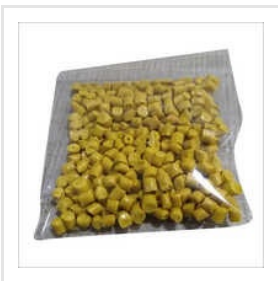
Natural Yellow PP Granules