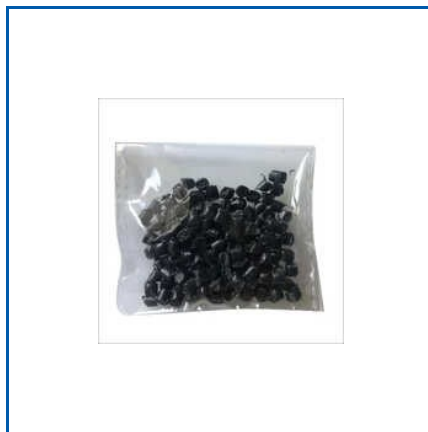
BLACK POLY PROPYLENE GRANULES