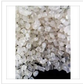
Transparent Poly Propylene Granules