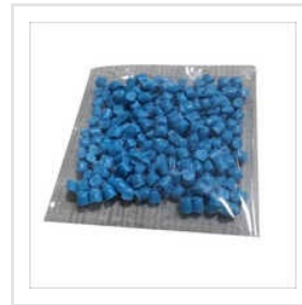
Natural Blue PP Granules