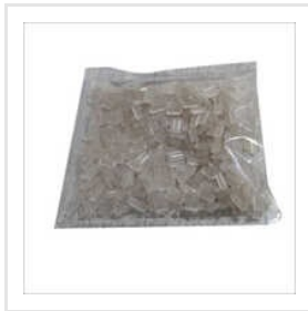
White Reprocessed PP Granules