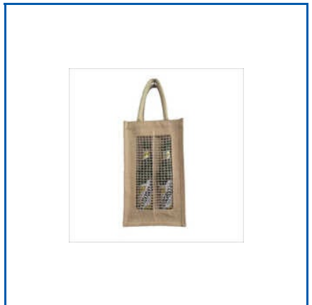
JUTE TWO BOTTLE BAG