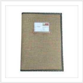
Jute File Folder