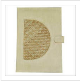
Jute Rectangular File Folder