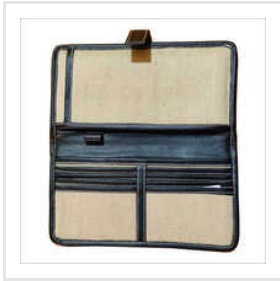
Jute Document Folder