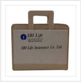
Jute Printed Conference Bag