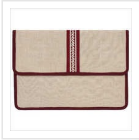
Jute Designer File Folder