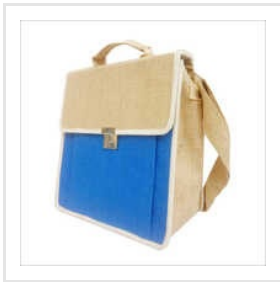
Jute Office Bag