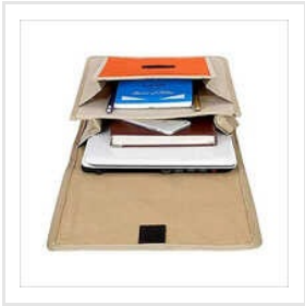
Jute Brown Document Folder