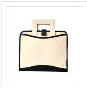
Jute Fancy Conference Bag