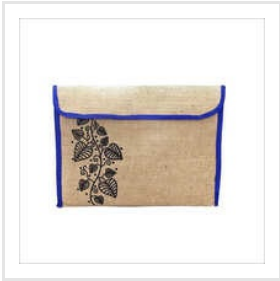
Jute Rectangular Envelope Folder