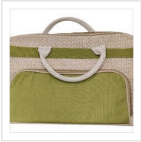
Jute Padded Compartment Laptop