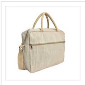
Jute Plain Laptop Bag