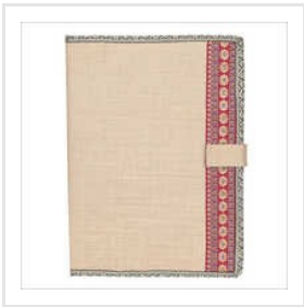
Jute Plain File Folder