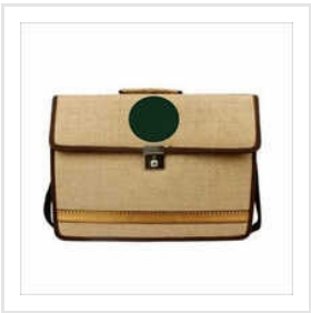
Jute Conference Laptop Bag