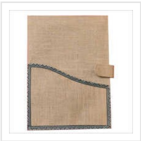
Jute Brown Color File Folder