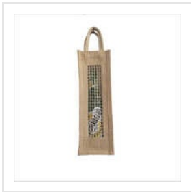
Jute Single Bottle Bag