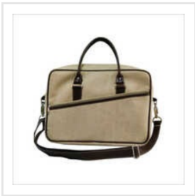
Jute Office Laptop Bag