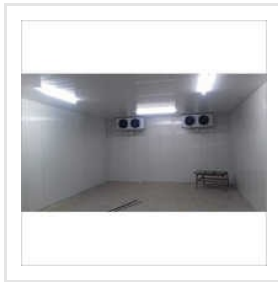
Industrial Cold Room