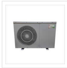
1.5 Ton Outdoor Unit