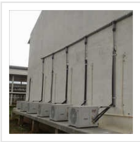
Industrial Cold Room Outdoor Unit