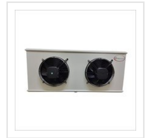
1.5 Ton Indoor Unit