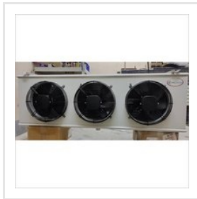
Indoor Unit 3 Ton