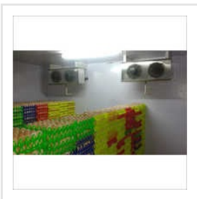
Egg Cold Room