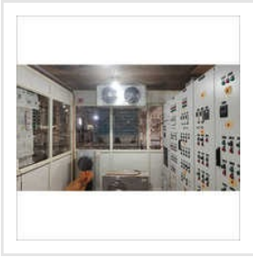
PLC Cold Room