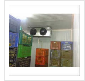
Banana Ripening Chamber Cold Room