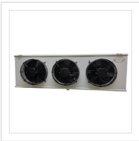
3 Ton Indoor Unit