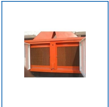
INDUSTRIAL AIR HANDLING UNIT