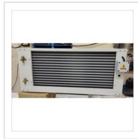
Indoor Unit 1.5 Ton