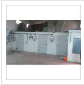
Coldroom Frient Look Work In Progreses