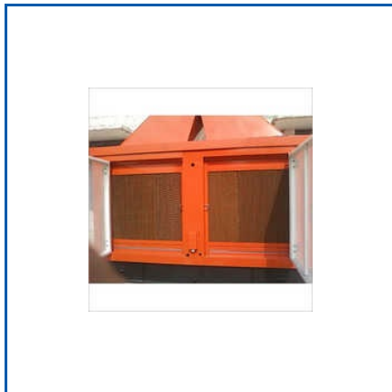
AIR HANDLING UNIT