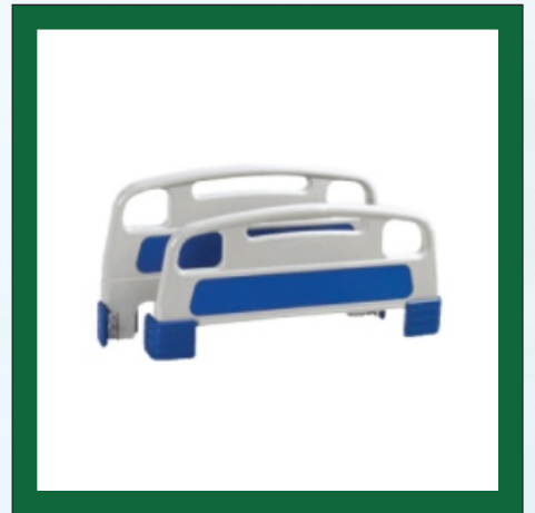
Hospital PP Head And Leg Bows