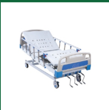
5 Function Deluxe Manual ICU Bed