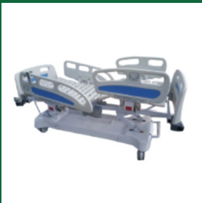
5 Function Excel Plus Motorized ICU Bed