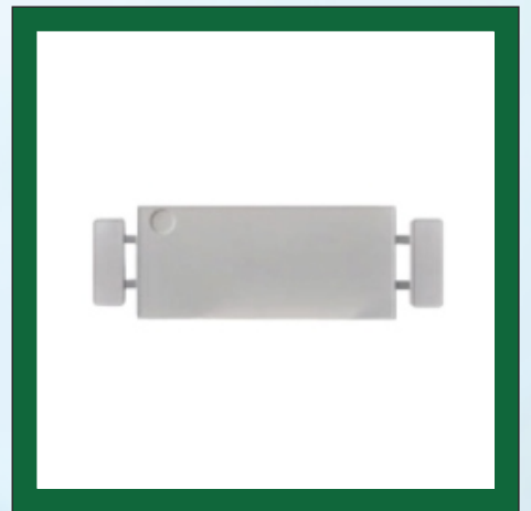
Hospital ABS Expandable Food Tray