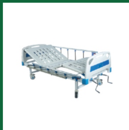
2 Function Deluxe Manual Fowler Bed