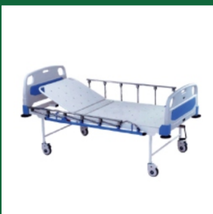
1 Function Premium Motorized Semi Fowler Backrest Bed