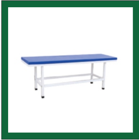
Hospital Attendant Bed