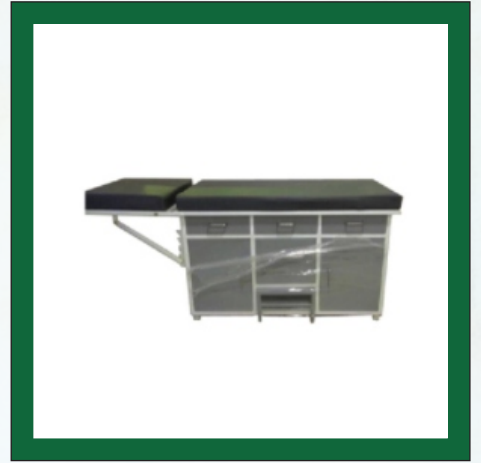
Hospital Examination Couch