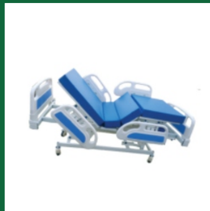
5 Function Premium Motorized ICU Bed