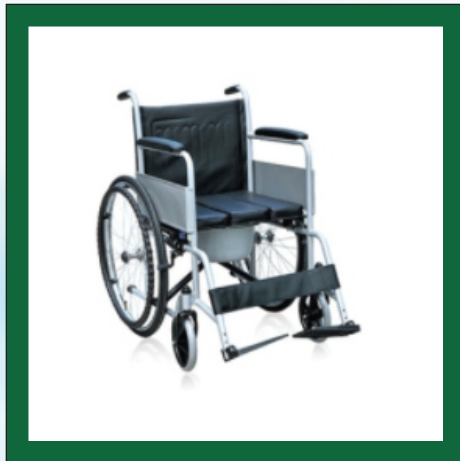
Non Folding Commode Wheelchair