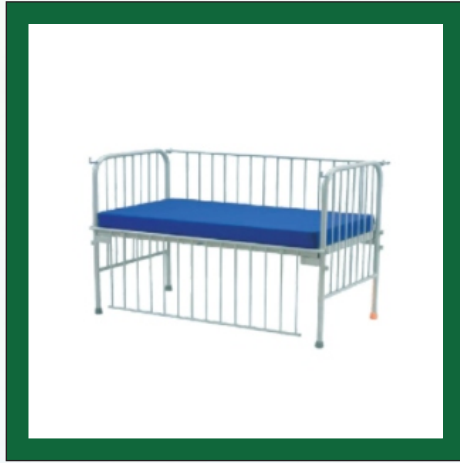
Classic Hospital Pediatric Bed