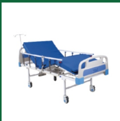
2 Function Premium Motorized Fowler Bed