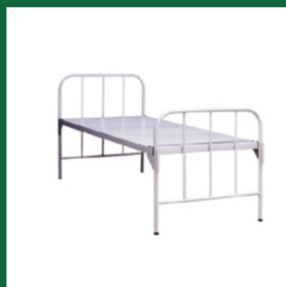
Hospital Plain Bed