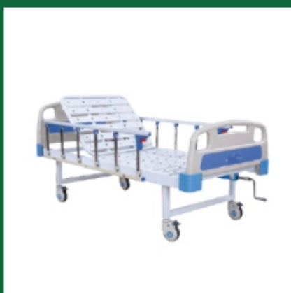
1 Function Economy Manual Semi Fowler Backrest Bed