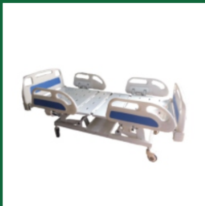
5 Function Motorized ICU Bed