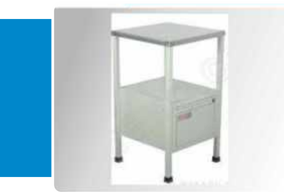
Size: 355mm x 380mm x 760mm ht