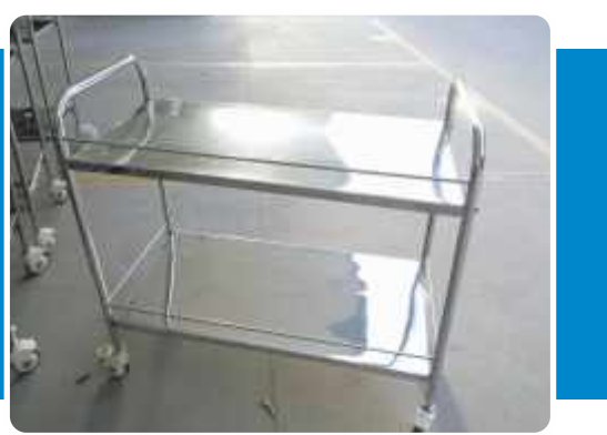
MHF-147 INSTRUMENT TROLLEY

Size: 915mm x 530mm x 810mm ht (M-147A) Size: 760mm x 530mm x 810mm ht (M-147B) Size: 610mm x 450mm x 810mm ht (M-147C)