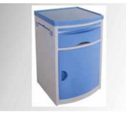
Size: 385mm x 390mm x 760mm ht