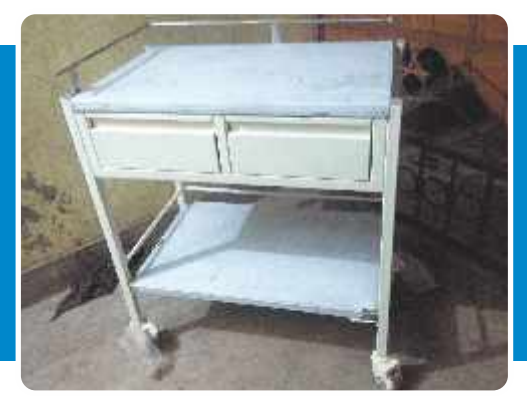
Size: 610mm x 455mm x 810mm ht