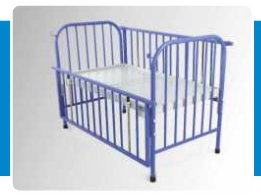
Size: 1870mm x 825mm x 560mm ht