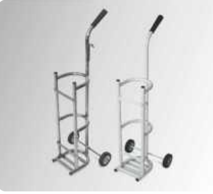
Size: 300mm x 300mm x 510mm