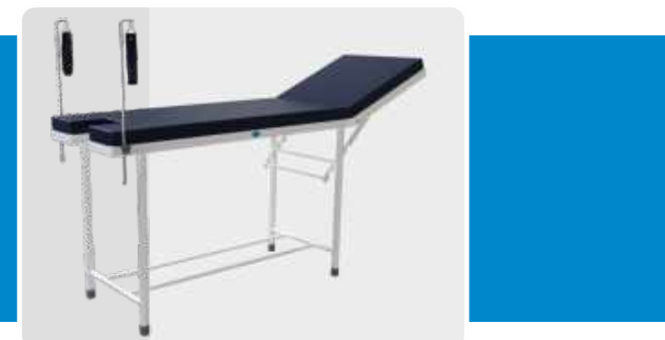
Size: 1830mm x 610mm x 7600mm ht