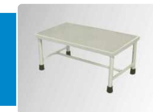
Size: 610mm x 455mm x 305mm ht