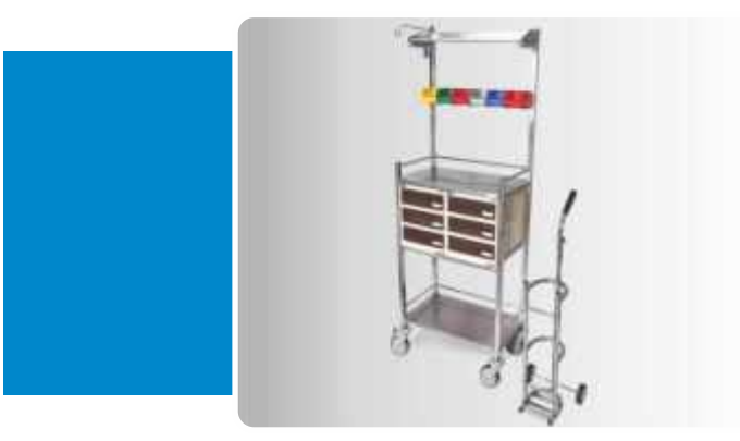
Size: 1525-940mm (H) x 380mm (W) x 675mm (L)