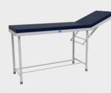
MHF-135 EXAMINATION COUCH