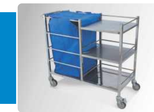
Size: 460mm x 920mm x 860mm ht