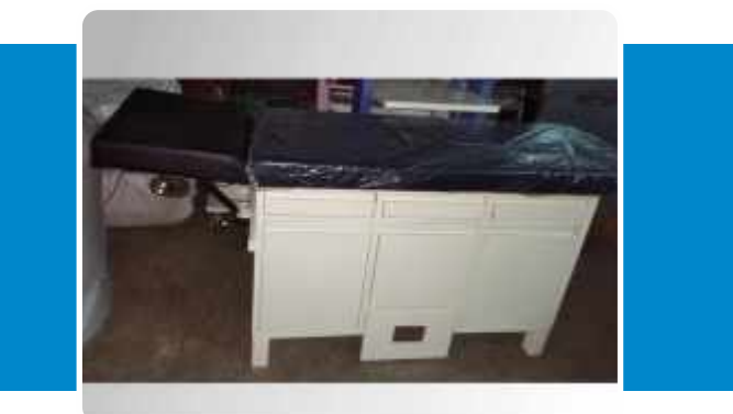
Size: 1830mm x 610mm x 7600mm ht