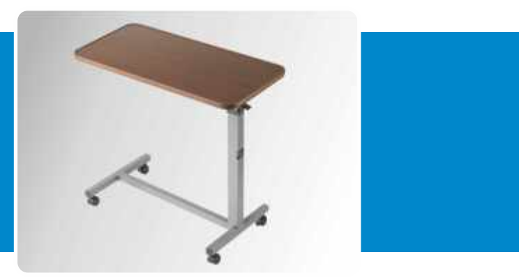
Size: 660mm x 405mm x 810-1270mm ht