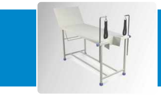
Size: 1830mm x 610mm x 7600mm ht