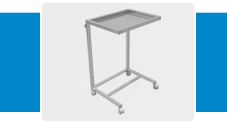
Size: 800mm x 500mm x 810 to 1270mm ht