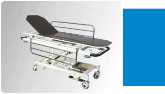
Size: 2130mm x 610mm x 610mm ht