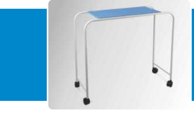
Size: 1115mm x 455mm x 965mm ht