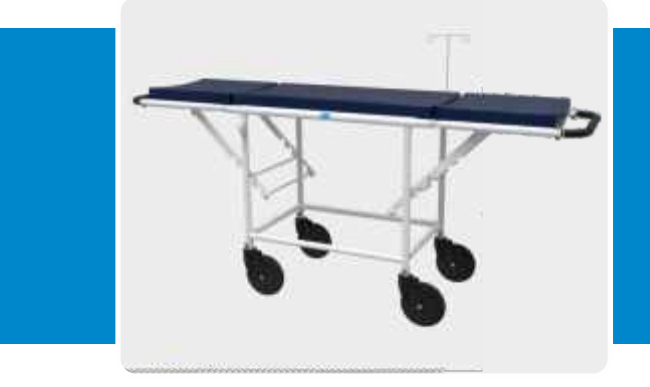
Size: 2130mm x 610mm x 810mm ht