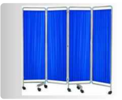
MHF-131 BED SIDE SCREEN 4 FOLD