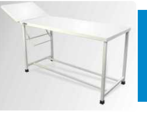
Size: 1830mm x 610mm x 7600mm ht