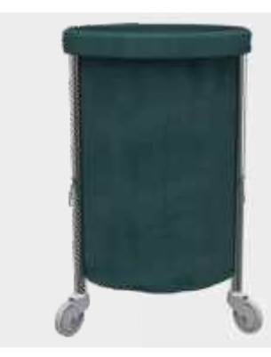
Size: 460mm x 860mmht