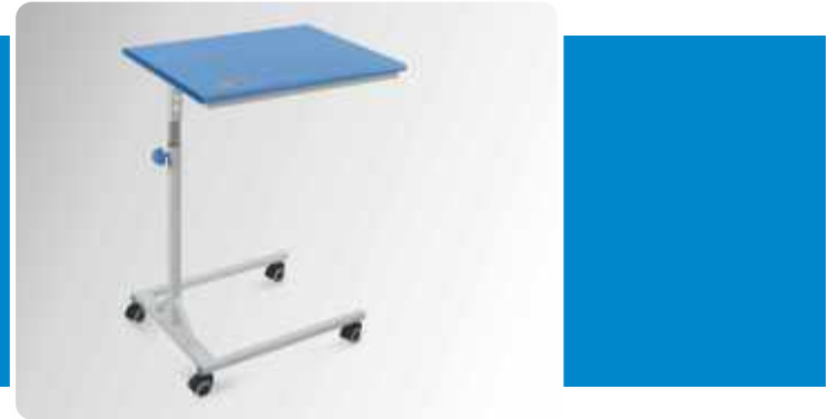
MHF-124 ADJUCTABLE BED SIDE TABLE