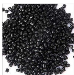
PVC Molding Compound