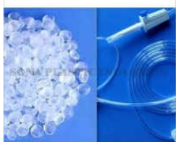
PVC Compound For Medical Applications