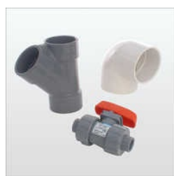
PVC Compound For Pipe Fittings