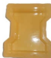
Flexible PVC Compound