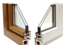
PVC Building Compound