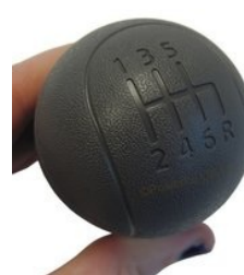
PVC Automotive Compound