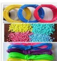
Cable PVC Compound