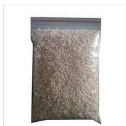
PVC CABLE RAW COMPOUND