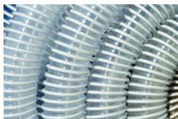
General Purpose PVC Compound