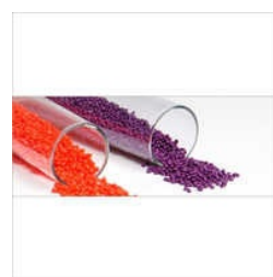
PVC Plastic Compound