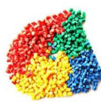
Tubes PVC Compound