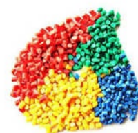
PVC Compound For Moulding Applications