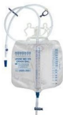
MEDICAL GRADE PVC TUBING

Automotive Application PVC Compound, Cable PVC Compound, Clear PVC Tube, FRLS PVC Compound, Flexible PVC Compound, Footwear PVC Compound, General Purpose PVC Compound, Hoses PVC Compound, Industrial PVC Compounds, Industrial Polyethylene Pvc Compounds, Medical Grade PVC Compound, Medical Grade PVC Tubing, PVC Automobile Compound, PVC Automotive Compound, PVC Bottle Compound, etc.