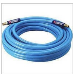
Hoses PVC Compound