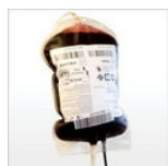
PVC Medical Grade Compound & Tubing