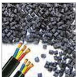
PVC Cable Compound