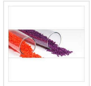
PVC Plastic Compound