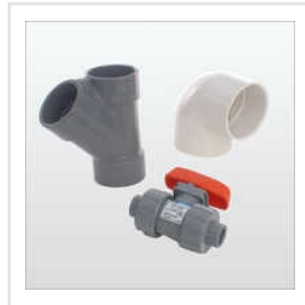
PVC Compound For Pipe Fittings