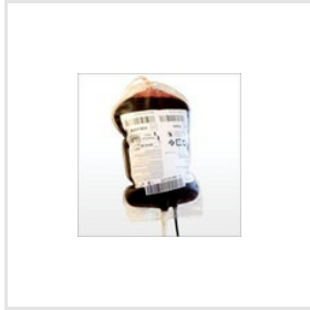
PVC Medical Grade Compound & Tubing