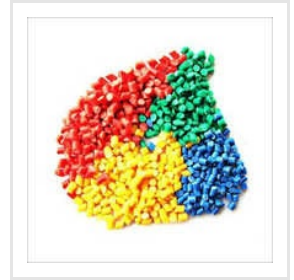
PVC Compound For Moulding Applications