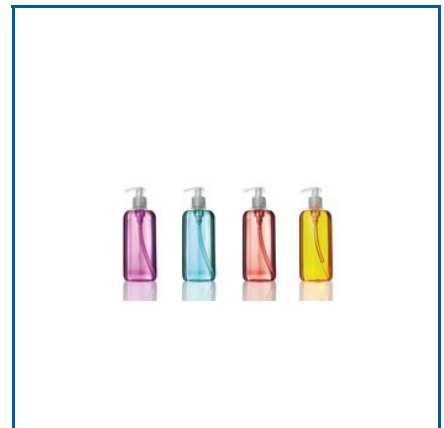
PVC BOTTLE COMPOUND