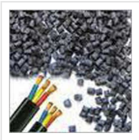
PVC Cable Compound