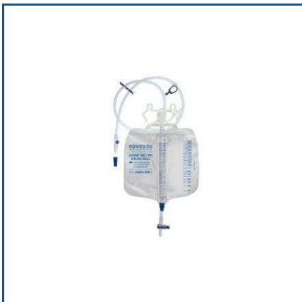
MEDICAL GRADE PVC TUBING

Automotive Application PVC Compound, Cable PVC Compound, Clear PVC Tube, FRLS PVC Compound, Flexible PVC Compound, Footwear PVC Compound, General Purpose PVC Compound, Hoses PVC Compound, Industrial PVC Compounds, Industrial Polyethylene Pvc Compounds, Medical Grade PVC Compound, Medical Grade PVC Tubing, PVC Automobile Compound, PVC Automotive Compound, PVC Bottle Compound, etc.