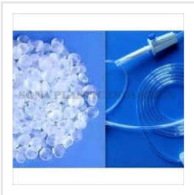
PVC Compound For Medical Applications