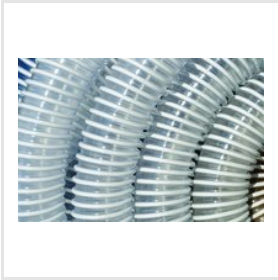
General Purpose PVC Compound