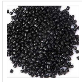
PVC Molding Compound