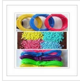
Cable PVC Compound