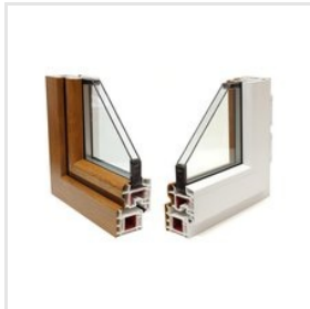
PVC Building Compound