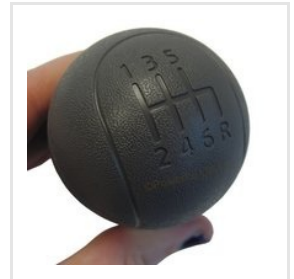
PVC Automotive Compound