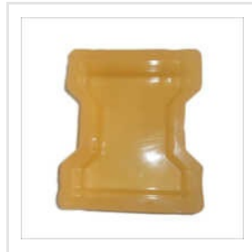
Flexible PVC Compound