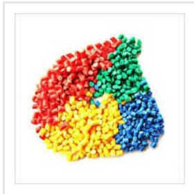
Tubes PVC Compound