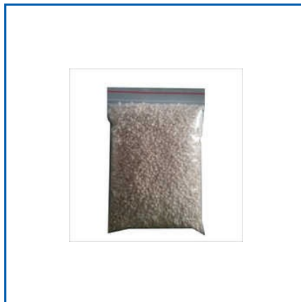
PVC CABLE RAW COMPOUND